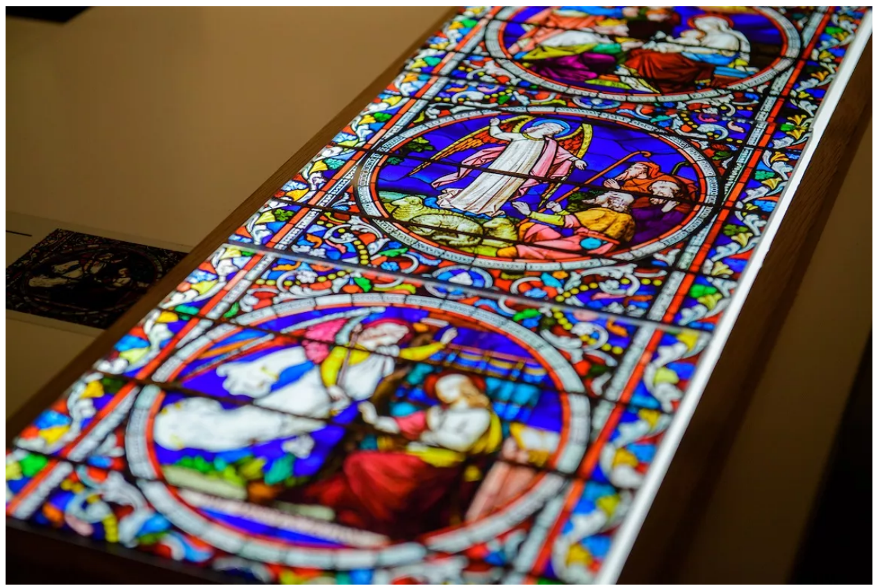
Lincoln Cathedral's magnificent stained glass windows