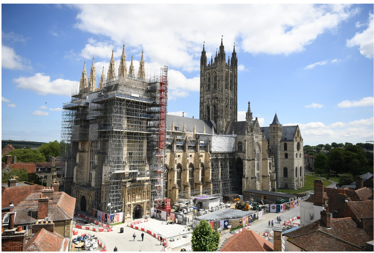
Canterbury Cathedral undergoing restoration

The Cathedral – which is a World Heritage Site, Scheduled Ancient Monument and Grade I listed structure – is open to the public throughout the summer. The Canterbury Journey Project is due to be completed in Autumn 2022.