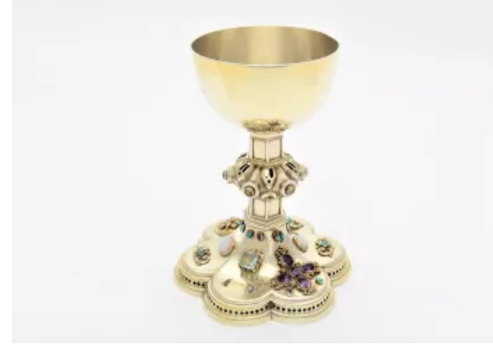
The missing jewelled chalice

Inside the Cathedral, digital guides and innovative interpretation will engage visitors in the fascinating stories and events which have shaped the building's history. People will have access to collections of archaeological artefacts, treasures, manuscripts and sculptures.