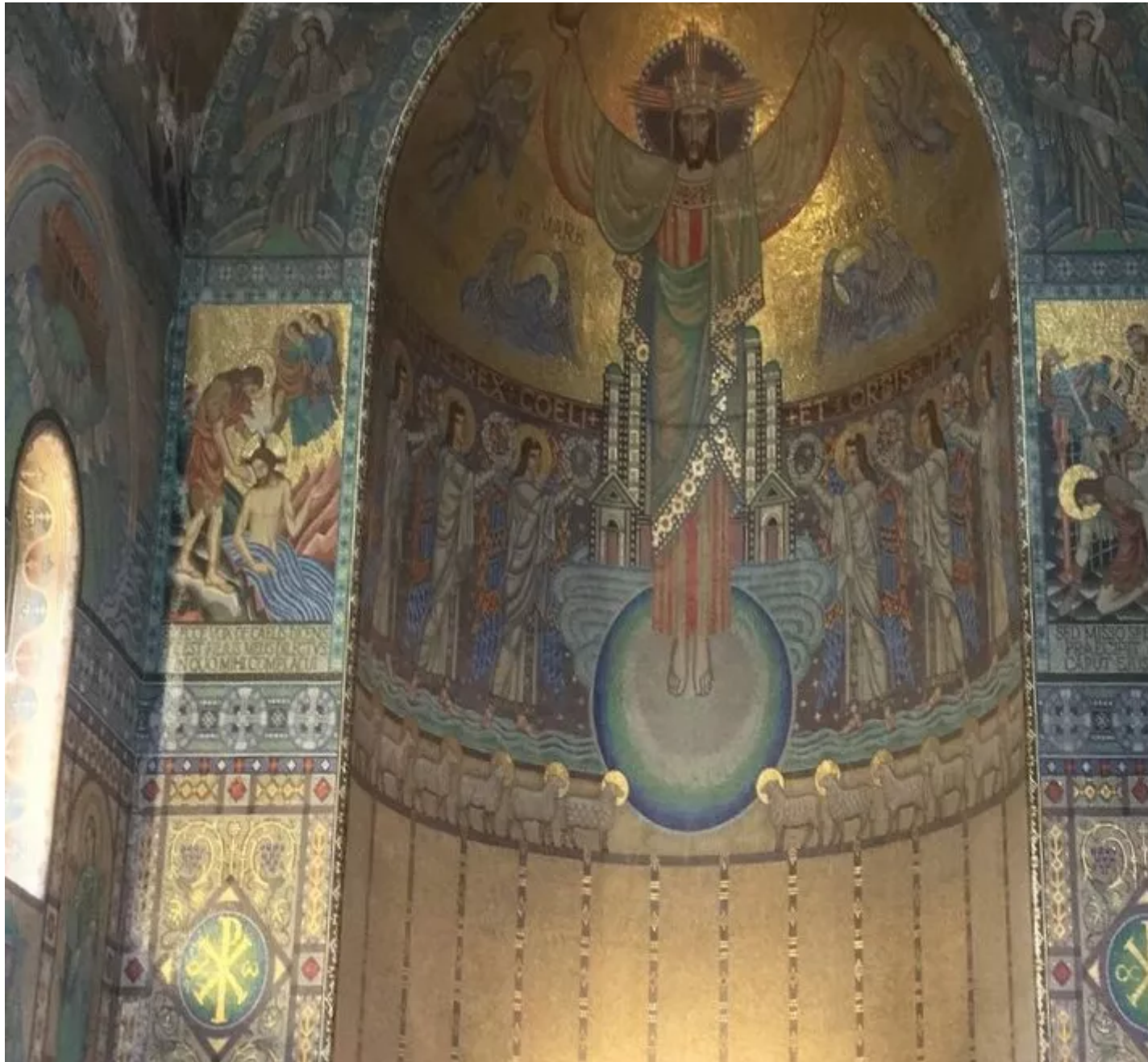
Mosaic dome at St John the Baptist RC Church, Rochdale.