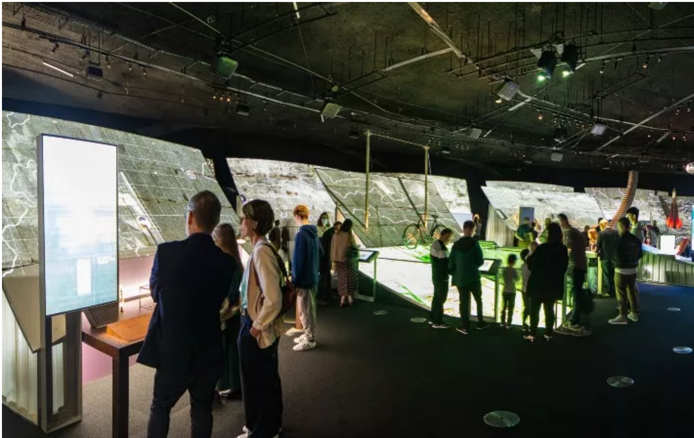
The First Light Exhibition at Jodrell Bank.

They will be able to experience the thrill of a meteor shower, crawl into a black hole, and even try 'driving' a radio telescope.