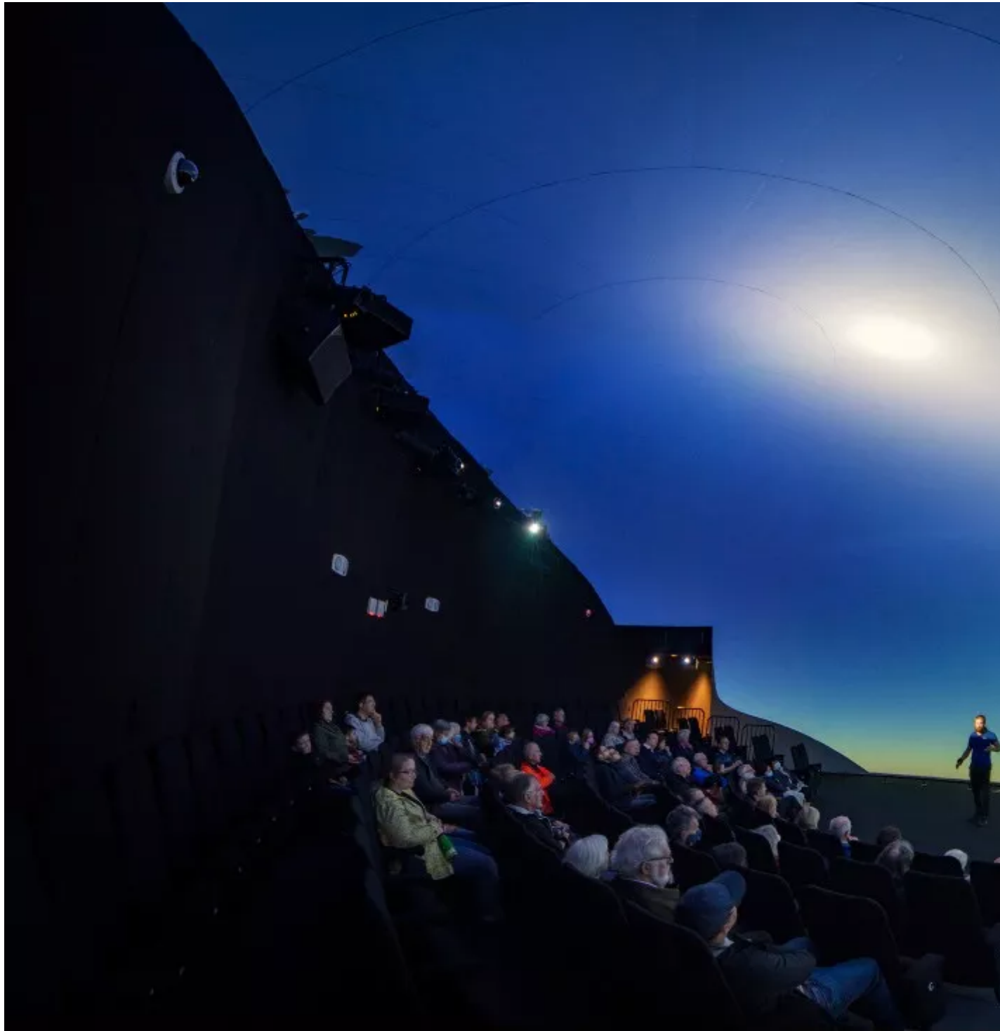
The Space Dome at Jodrell Bank.