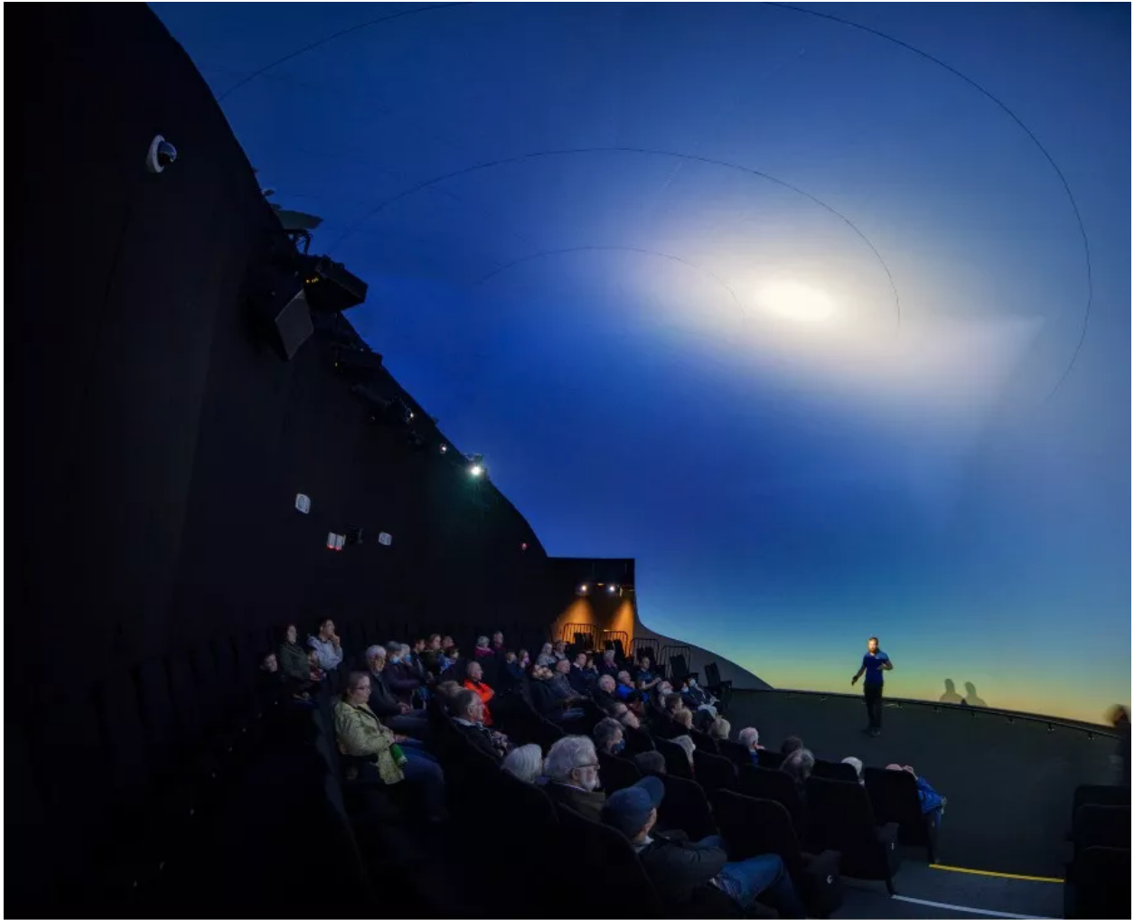
The Space Dome at Jodrell Bank.