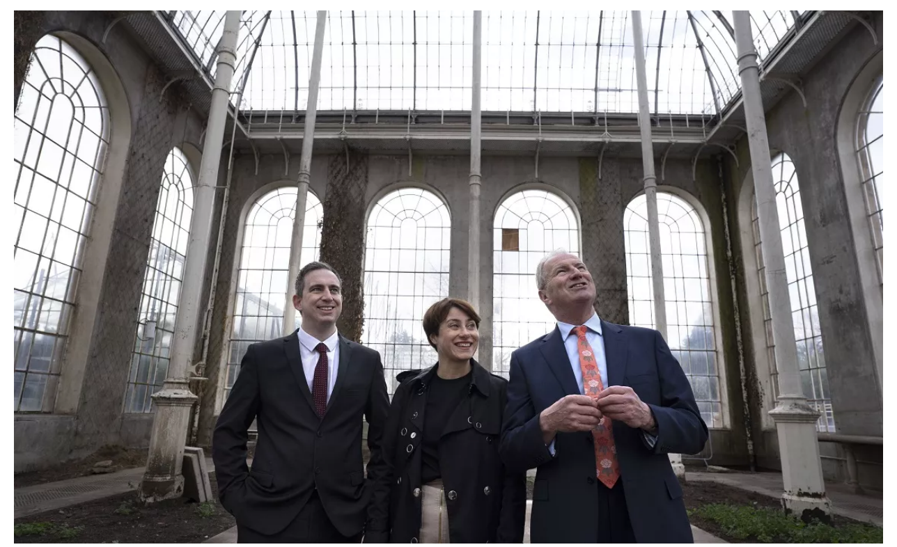
The Iconic Victorian Temperate Palm House.