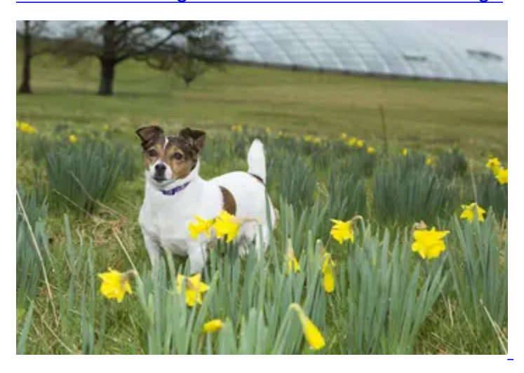
Mae Gardd Fotaneg Genedlaethol Cymru yn dathlu Dydd G?yl Dewi mewn steil gyda-gwerth miliynau o bunnoedd buddsoddiad