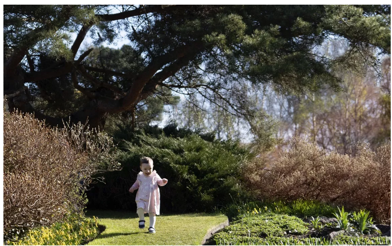
People of all ages can enjoy the gardens.

Edinburgh restored and revitalised for the benefit of generations to come. Thanks to National Lottery players, this significant grant will rescue these iconic buildings... engaging wider and more diverse audiences both locally and internationally."