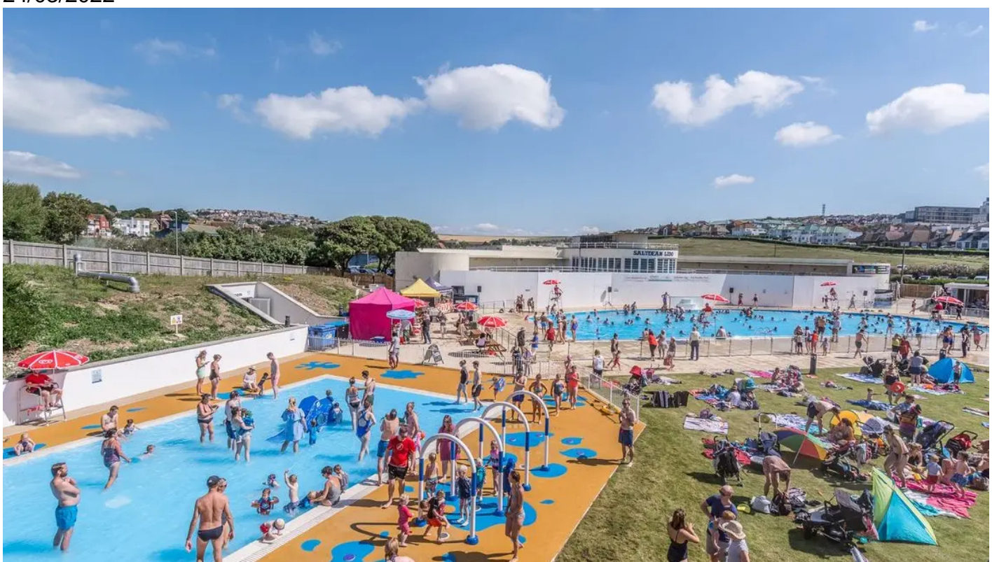
A £7.5million restoration project has begun to bring Saltdean Lido in East Sussex back to its former glory, thanks in part to investment from the Heritage Fund.

In the 1930s, Saltdean Lido's Art Deco building would have been bustling with Brighton locals and tourists enjoying the fashionable seaside resort.