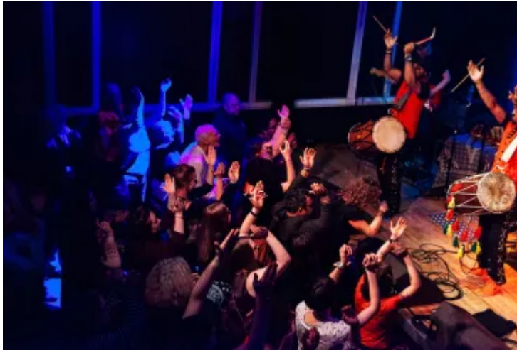
Taking in a gig at Band on the Wall, Manchester

It has made a huge difference for many of the UK's heritage treasures – from museums and music halls to lighthouses and lakes.