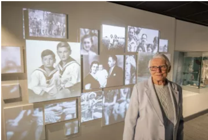
Preserving the past at The Holocaust Exhibition & Learning Centre, Huddersfield

The centre will be bringing out some of its rarest collections for National Lottery players. Go along to meet the archivist and find out what it means to preserve Holocaust heritage.