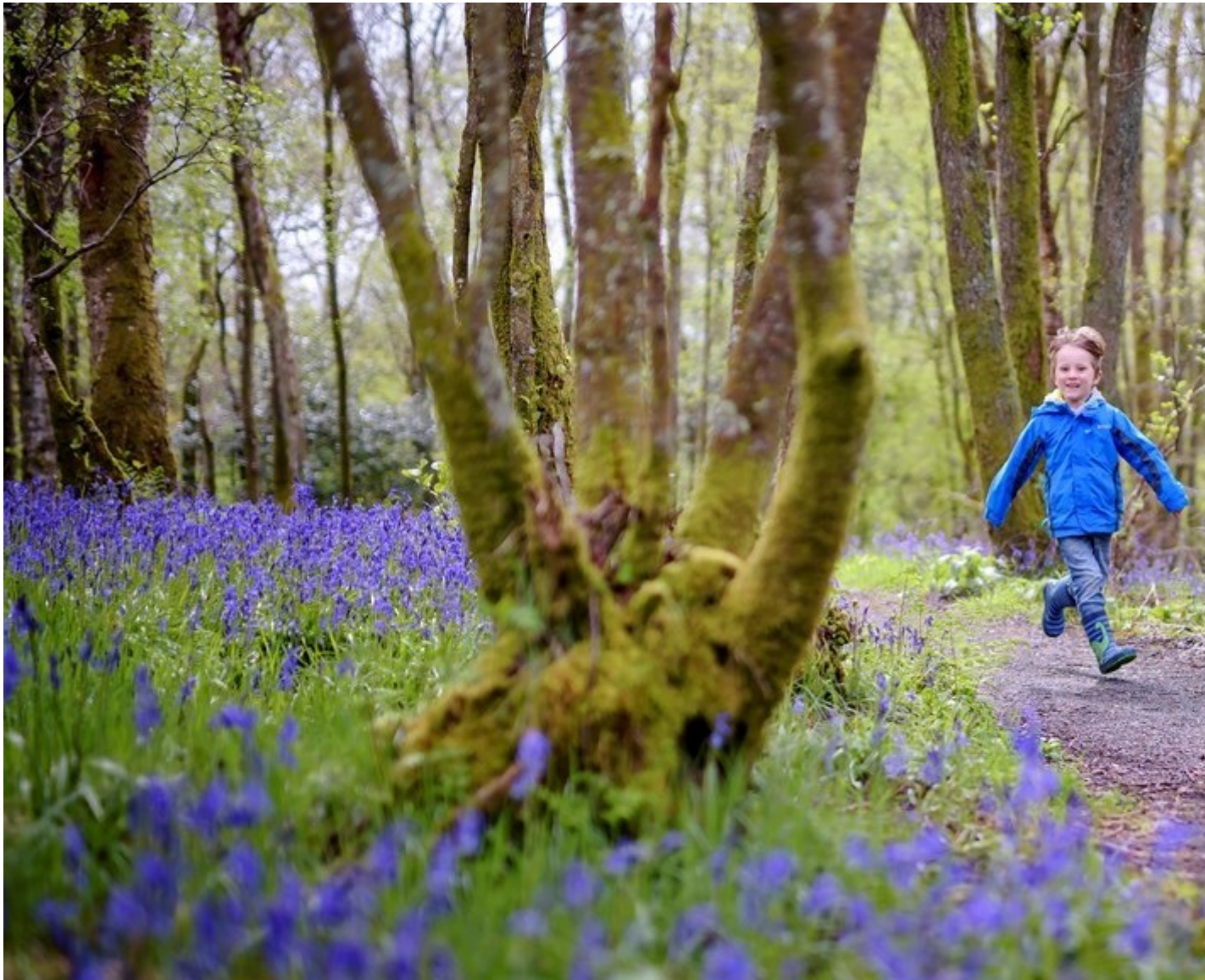
Exploring nature at RSPB Loch Leven.