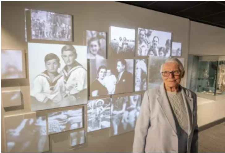
Preserving the past at The Holocaust Exhibition & Learning Centre, Huddersfield

The centre will be bringing out some of its rarest collections for National Lottery players . Go along to meet the archivist and find out what it means to preserve Holocaust heritage.