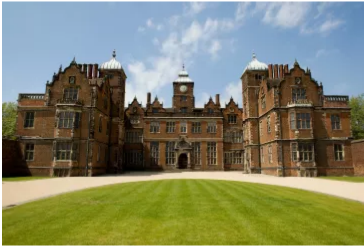
The stately Aston Hall in Birmingham

Explore over 30 rooms of this grand mansion, including King Charles' Chamber, the elaborate Great Stairs and the breath-taking Long Gallery. Top it off with a walk in Lady Holte's Garden. 50% off entry to Aston Hall is available throughout the week.