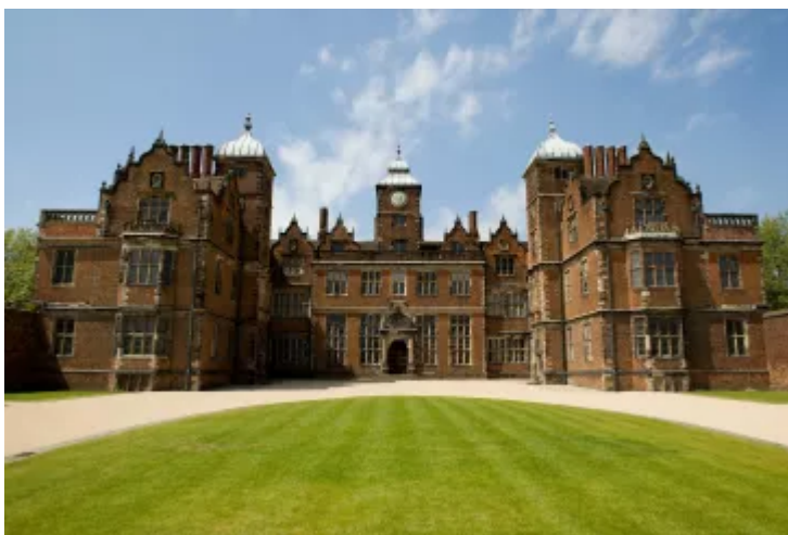
The stately Aston Hall in Birmingham