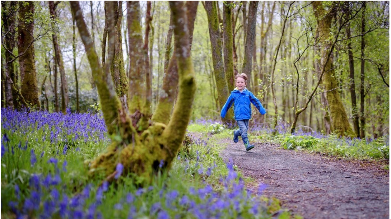
Exploring nature at RSPB Loch Leven.