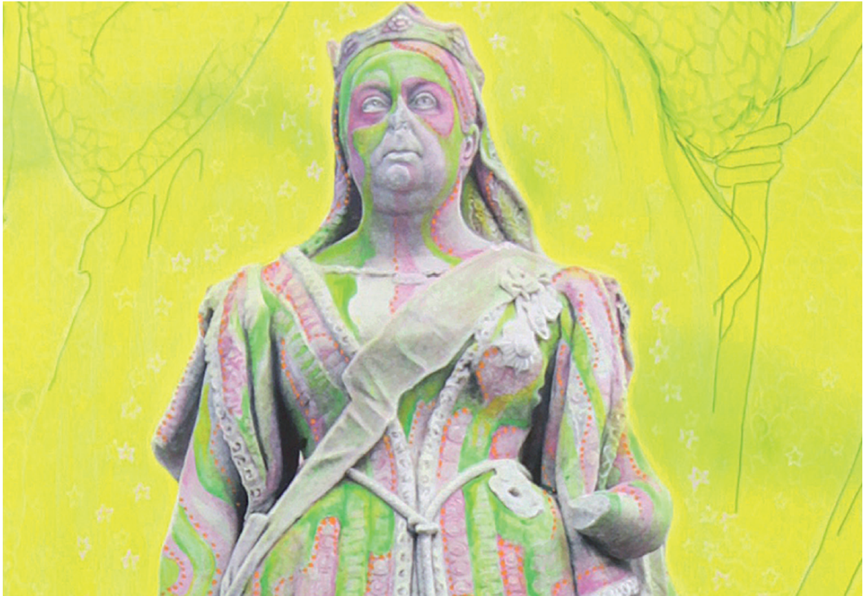
Queen Victoria sculpture.