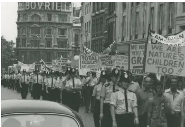
Pride march, 1974.

Find out more about all the amazing LGBTQ+ projects we have funded and take the next steps to starting your own.