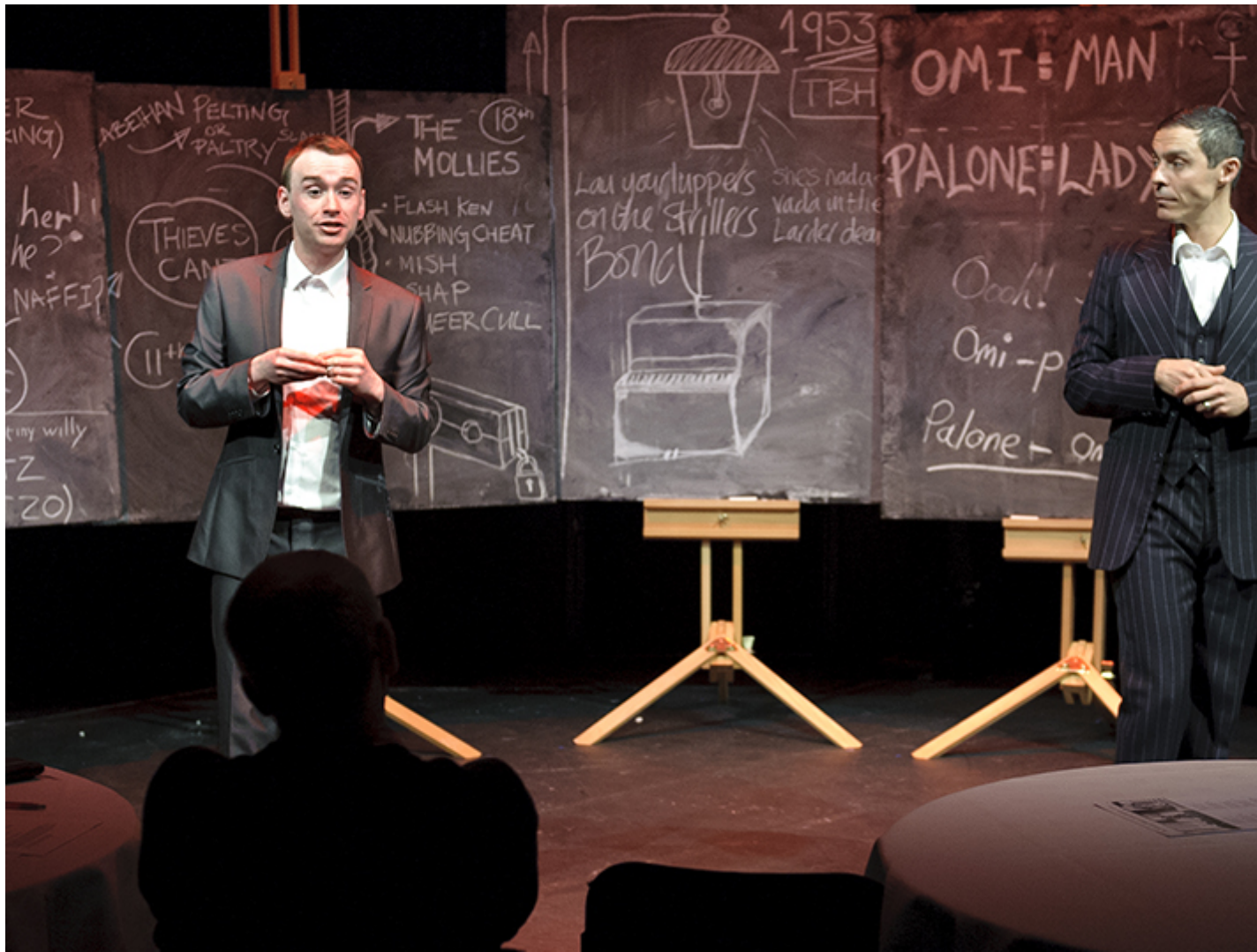
Polari Mission.

Jez: From the start, we thought we need to make this as inclusive as possible. And as older, white, cis gay men we're not necessarily the best people to start engaging in a meaningful way with black communities, for example.