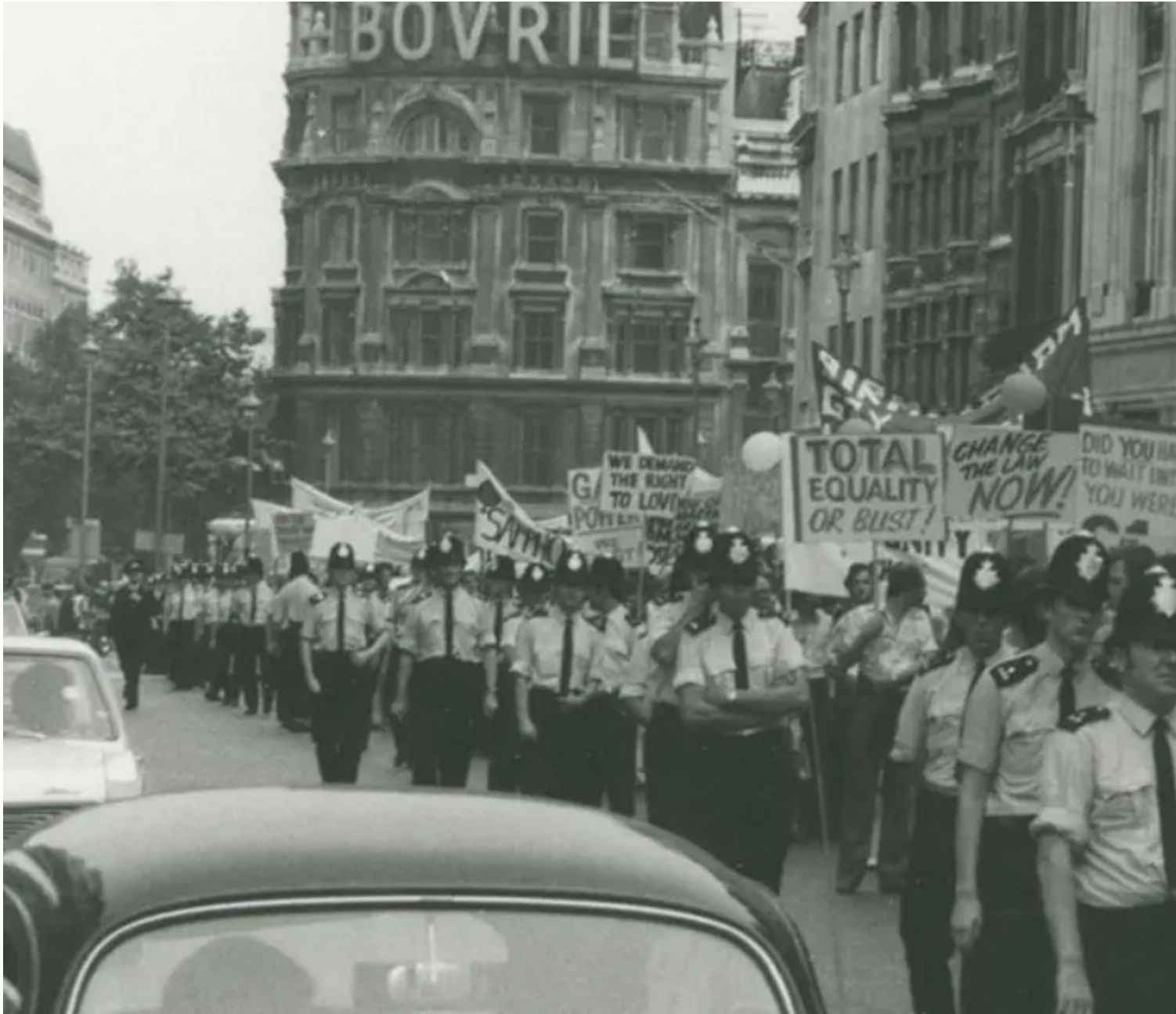
Pride march, 1974.

A new Heritage Fund project might be the last chance to capture the experiences of LGBTQ+ people in Manchester who remember life before the Sexual Offences Act 1967.