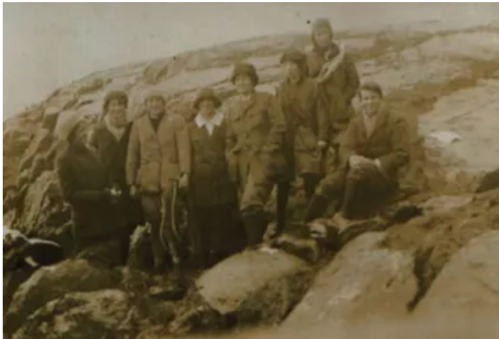
The Pinnacle Club's first meeting in 1921

National Lottery funding has helped projects share the heritage and unheard voices of many sports across the UK. Recent examples include: