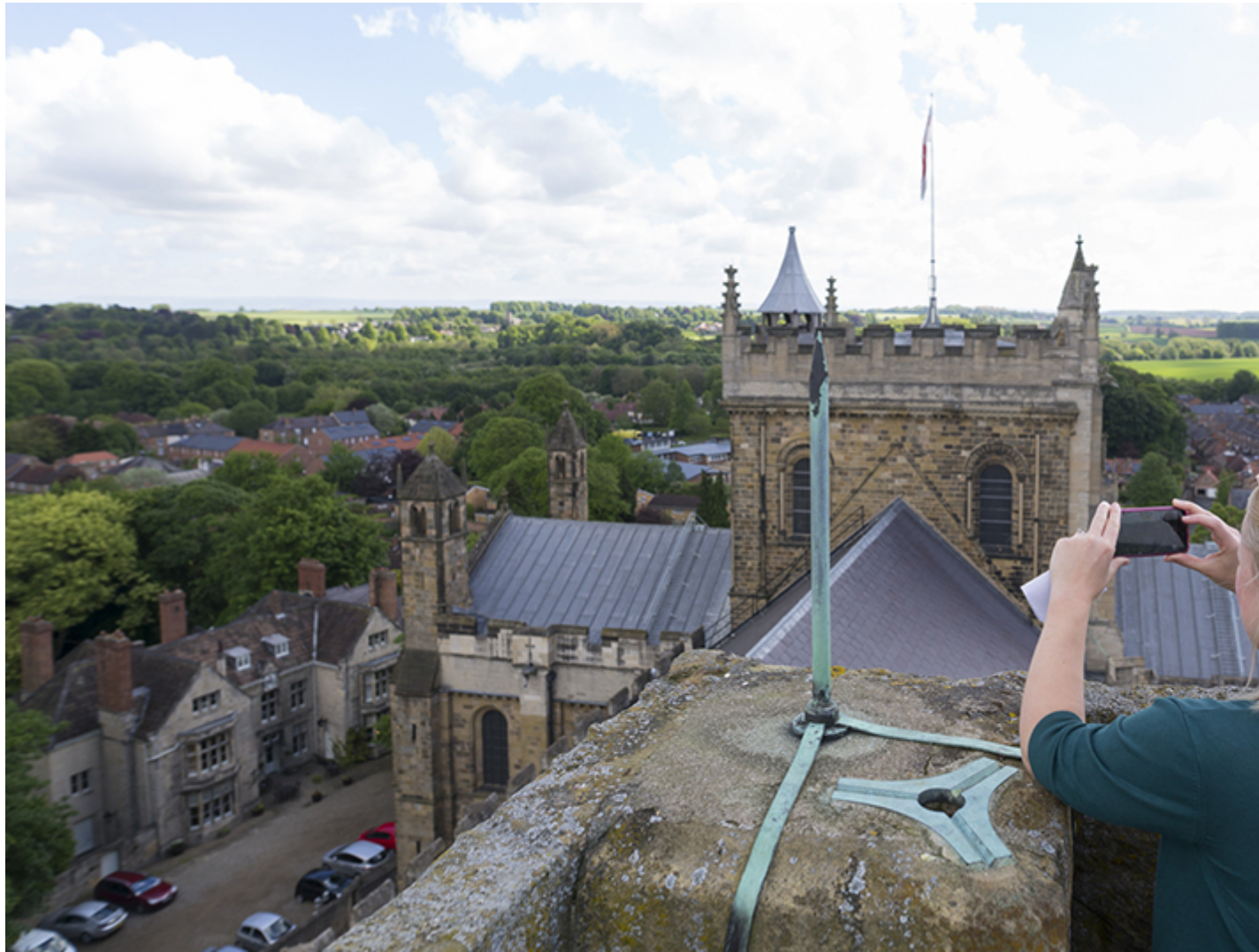
Ripon Cathedral from above.

Celebrating its 1,350th anniversary in 2022, Ripon Cathedral will offer digital and remote volunteering opportunities for the first time. The flexible home-based digital volunteering opportunities will enable the cathedral team to expand and diversify their current volunteering programme and, in turn, inspire future generations with roles in social media, visitor experience and heritage collections.