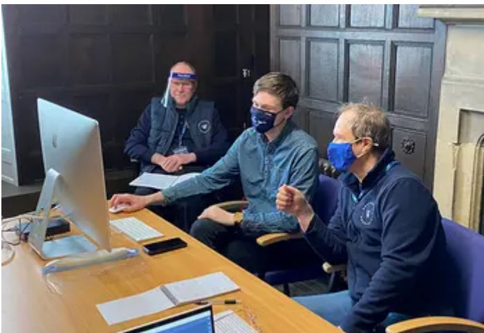
Wentworth Woodhouse volunteers