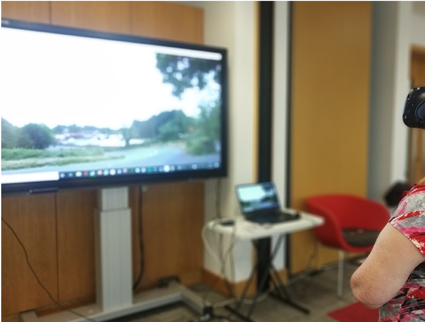
Enjoying a film created by a Public Records Office of Northern Ireland project

The Public Records Office of Northern Ireland will work with various communities including LGBTQ+ and disability groups, young people and volunteers from diverse ethnic backgrounds. The volunteers will be trained in the digital processing of archives, such as transcribing documents, adding metadata, indexing and cataloguing.