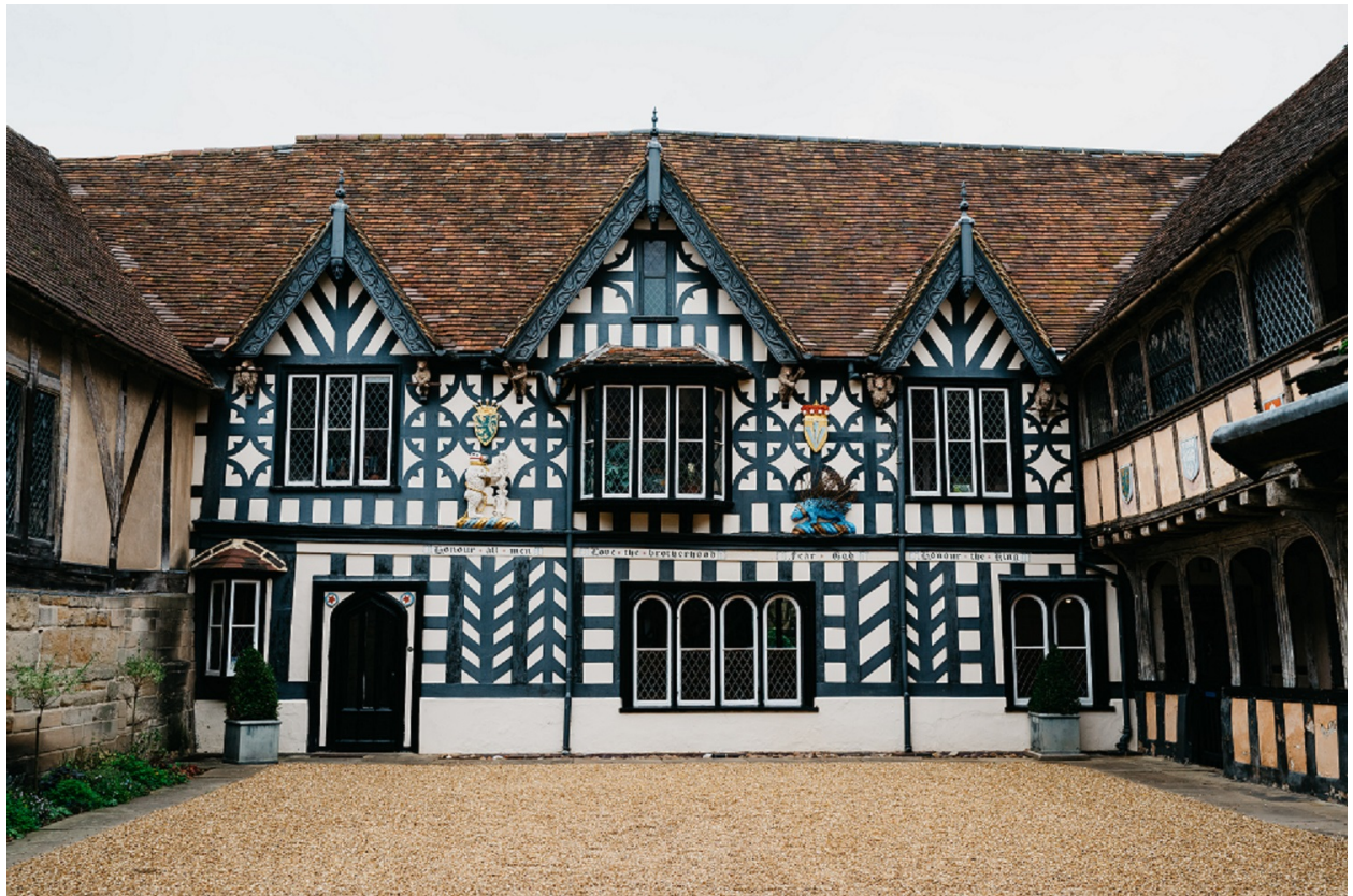
Lord Leycester courtyard.

Statesman and military commander Robert Dudley, 1st Earl of Leicester, acquired the buildings in 1571 and founded an almshouse for those "maimed or hurt in the wars in service of the Queen's majesty".