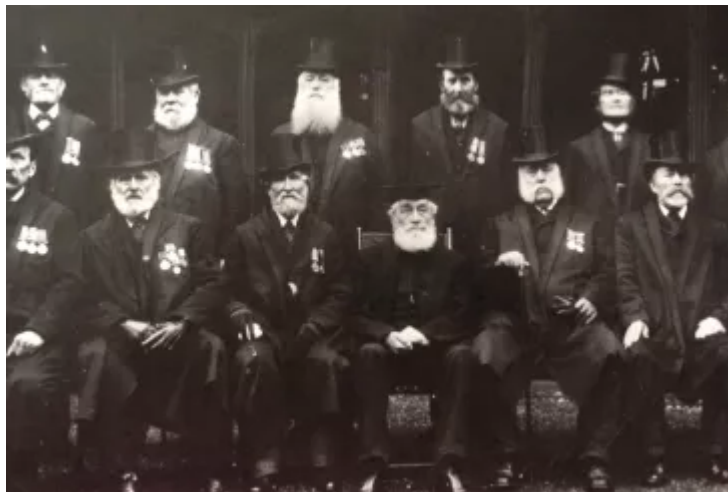
The Brethren in 1897.