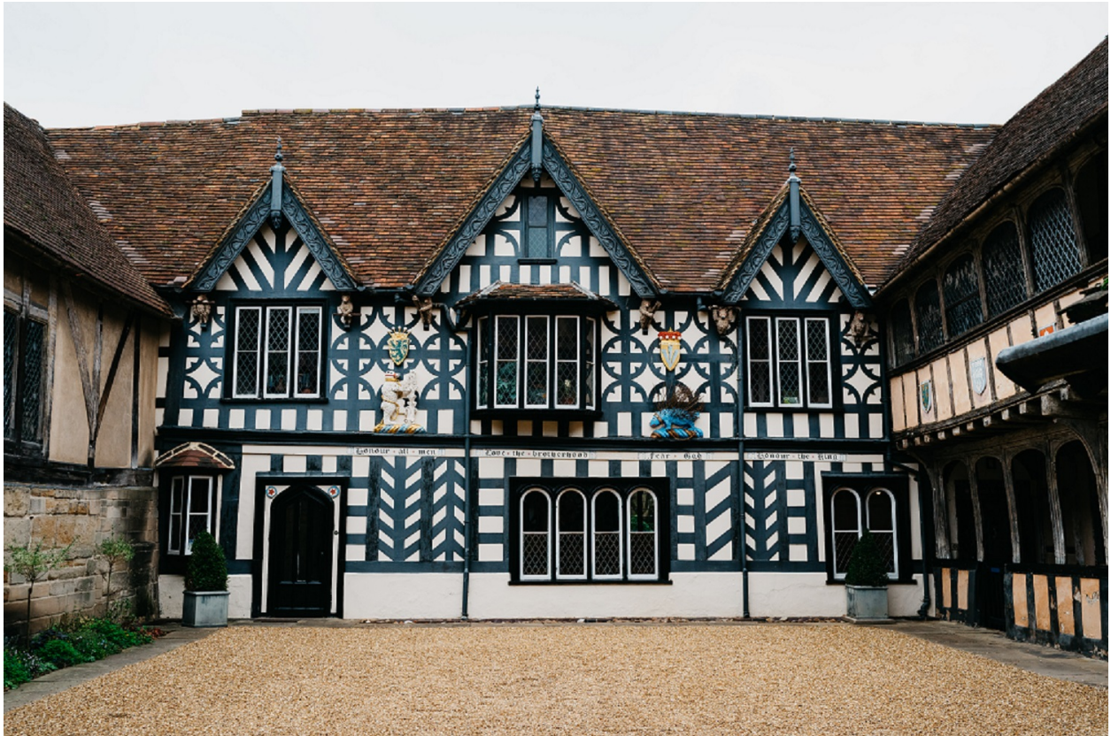
Lord Leycester courtyard.

Statesman and military commander Robert Dudley, 1st Earl of Leicester, acquired the buildings in 1571 and founded an almshouse for those "maimed or hurt in the wars in service of the Queen's majesty".