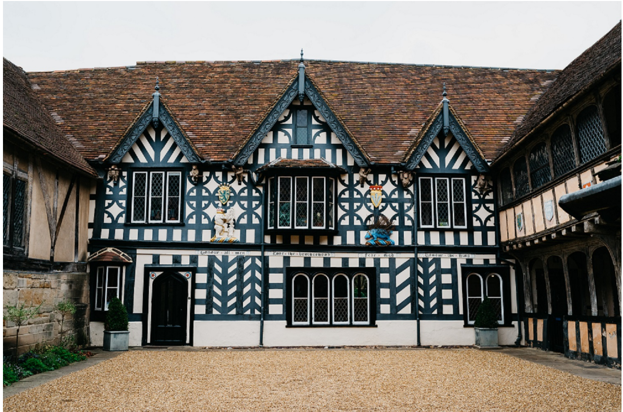
Lord Leycester courtyard.

Statesman and military commander Robert Dudley, 1st Earl of Leicester, acquired the buildings in 1571 and founded an almshouse for those "maimed or hurt in the wars in service of the Queen's majesty".