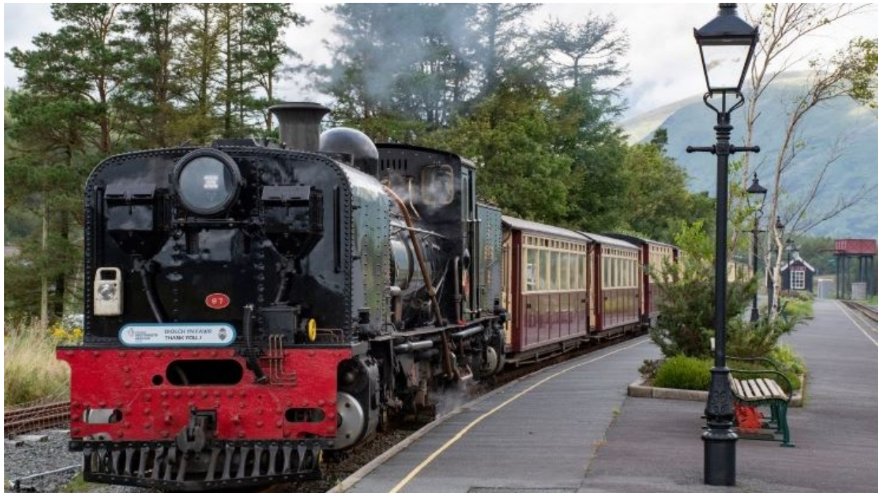
A Ffestiniog & Welsh Highland Railways train at a station.