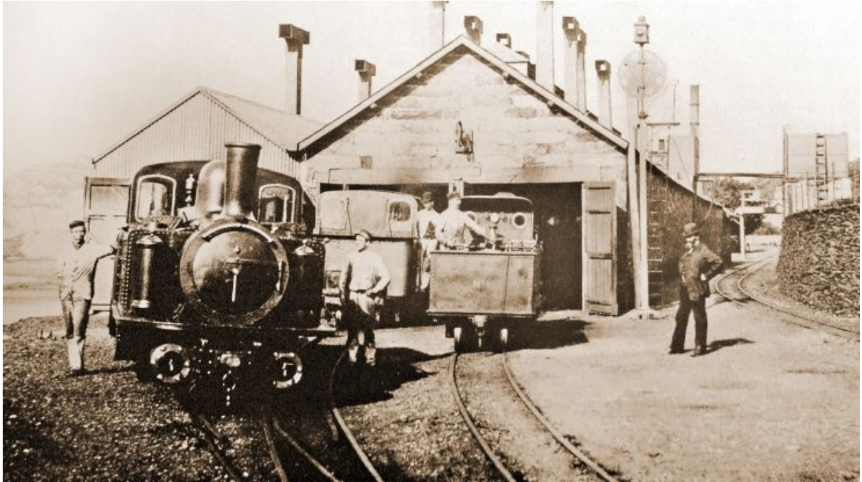
The Boston Lodge Works engine shed in 1887

“This project, which centres on the Boston Lodge Works, is a great example of how heritage can help us understand who we are and where we come from and how the communities we are part of have been shaped by the past by bringing history to life.”