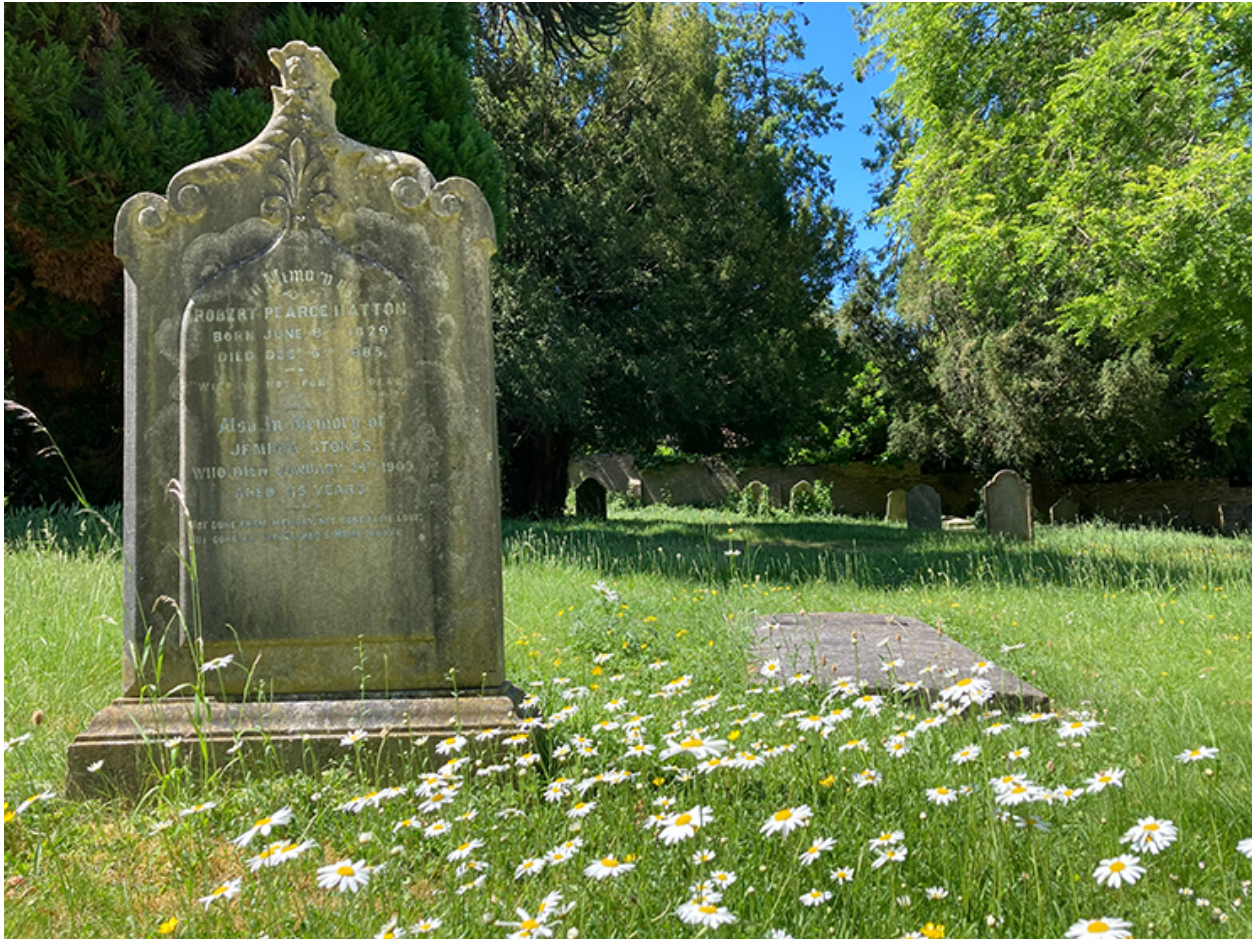
Grave surrounded by daisies at Rectory Lane Cemetery

The grantees created a wildlife corridor which boosted local wildlife. They also reduced their energy usage, used local sustainable suppliers and promoted sustainable practices to their visitors.