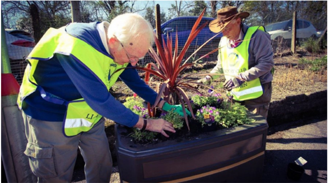
Volunteers planting flowers at a Welsh train station