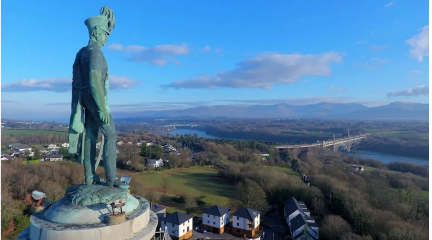
Marquess of Anglesey's Column

More than £14million has been awarded to projects that will help a wider range of people benefit from heritage.