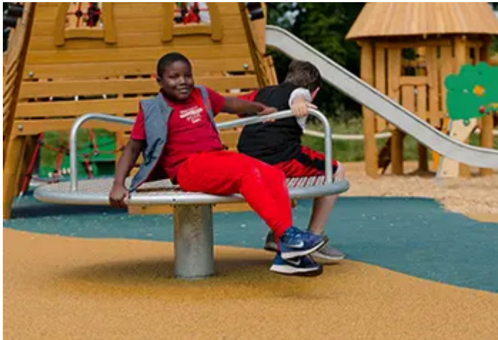
New play area at the David Livingstone Birthplace

The birthplace of one of Scotland's most famous explorers has re-opened following a £6.86million National Lottery grant.