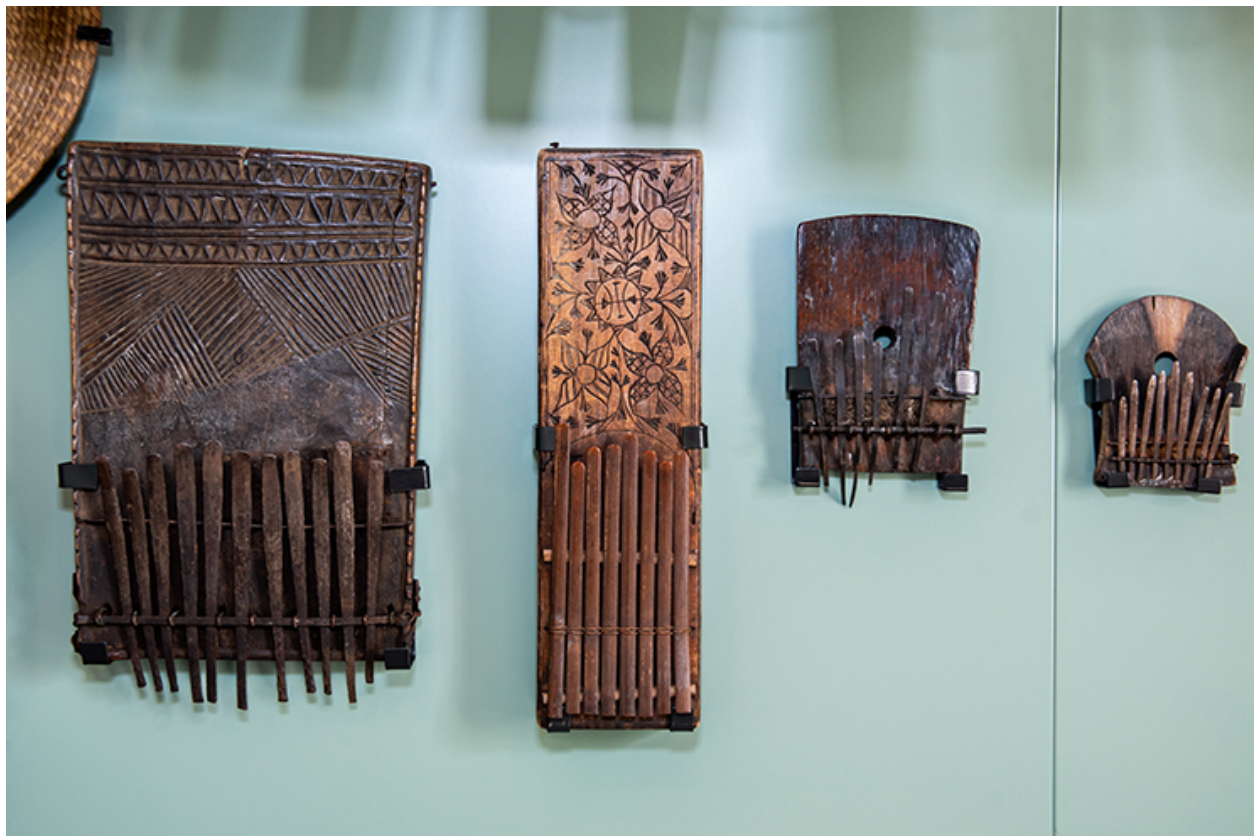
A selection of Southern and Central African objects on display in the museum.

Visitors will also be able to view a new video series produced in partnership with the Scotland Malawi Partnership. The series examines Livingstone's ongoing legacy and how it relates to faith, anti-racism, the story of Africa and his impact on colonialism.