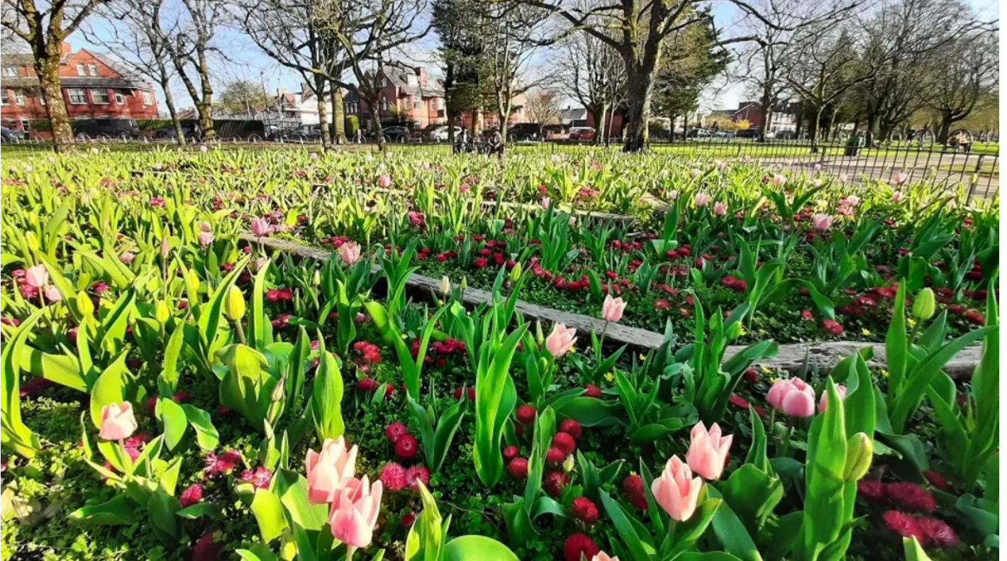
Flower beds in Victoria Park in Cardiff

We're launching a £380,000 grant programme to encourage people from disadvantaged and marginalised communities across Wales to get in touch with nature.