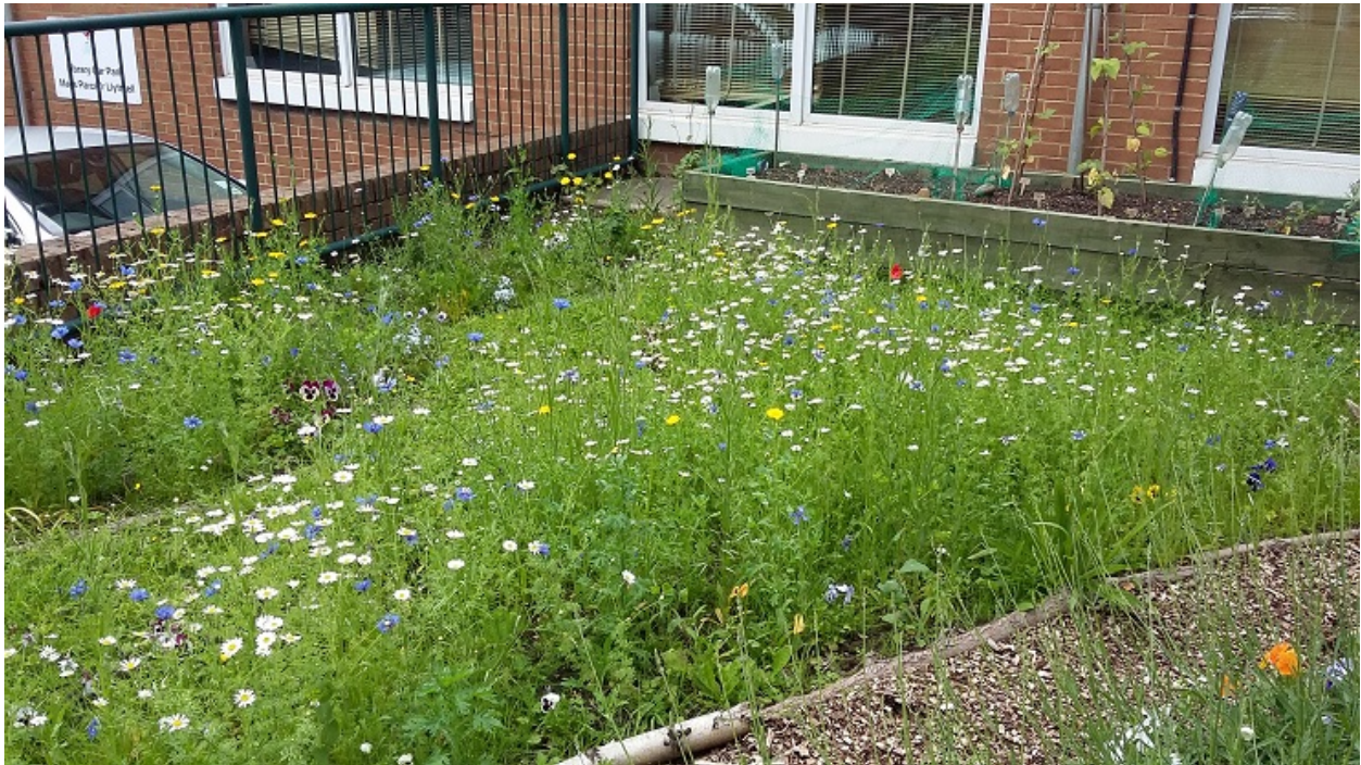
An urban garden full of wild flowers

“I would urge anyone working for a project or a group to check to see if you could be eligible for support.”