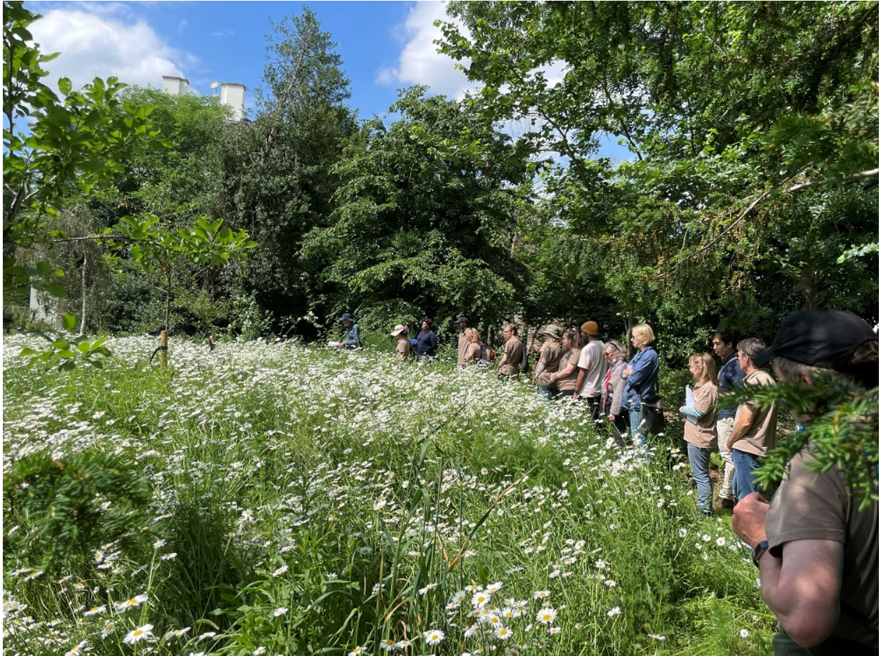
People interacting with nature

The new grant is part of the Welsh Government's Local Places for Nature programme which is committed to creating, restoring and enhancing nature.