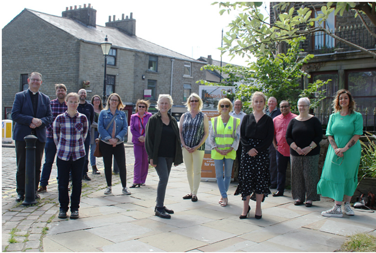
The Big Lamp team.