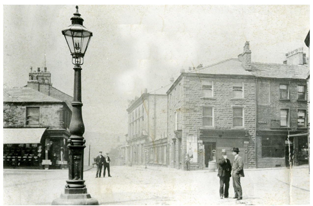
The 'big lamp' is a landmark in Haslingden.