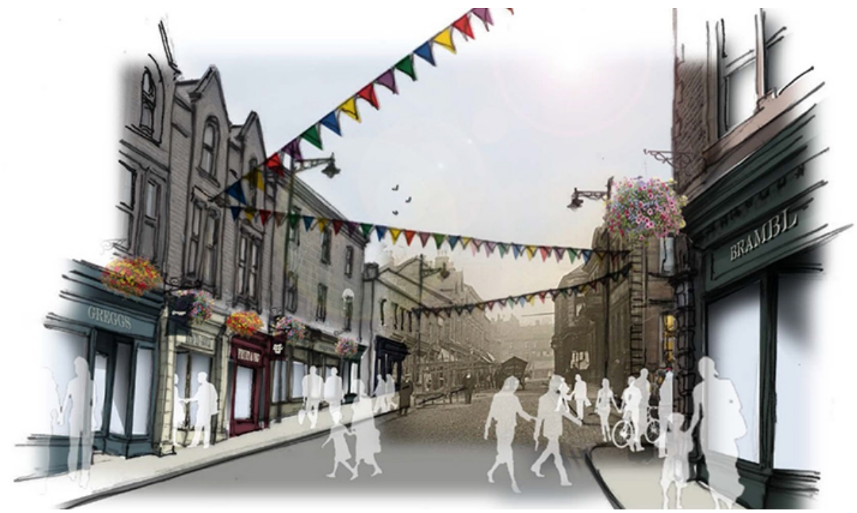
Artists impression of the regenerated town centre