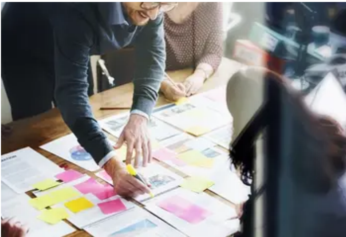
National Museum Day