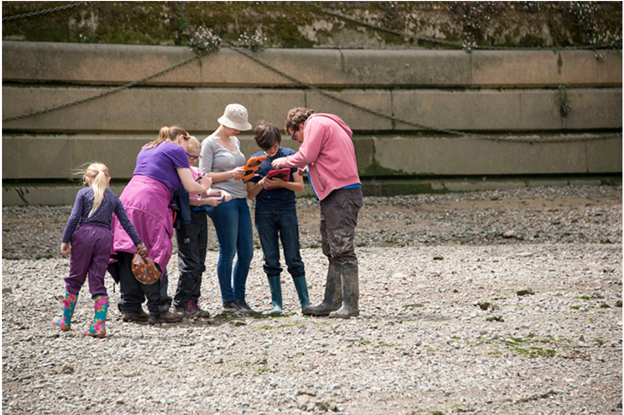
Thames Discovery Programme.