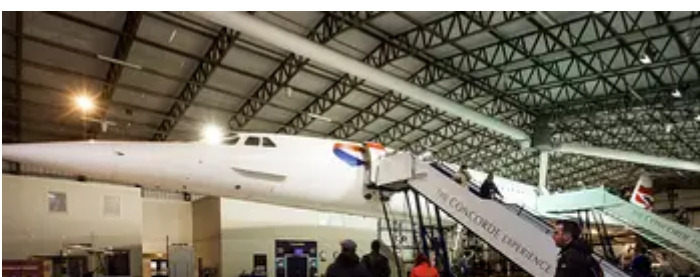
Young champions of UK heritage