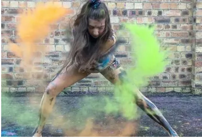
s LGBTQ+ heritage