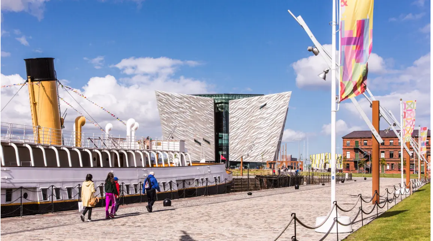
Titanic Belfast and SS Nomadic

£5.28million Department of Communities funding will support 50 heritage organisations and 41 heritage workers, reaching across the sector and keeping vital skills alive.