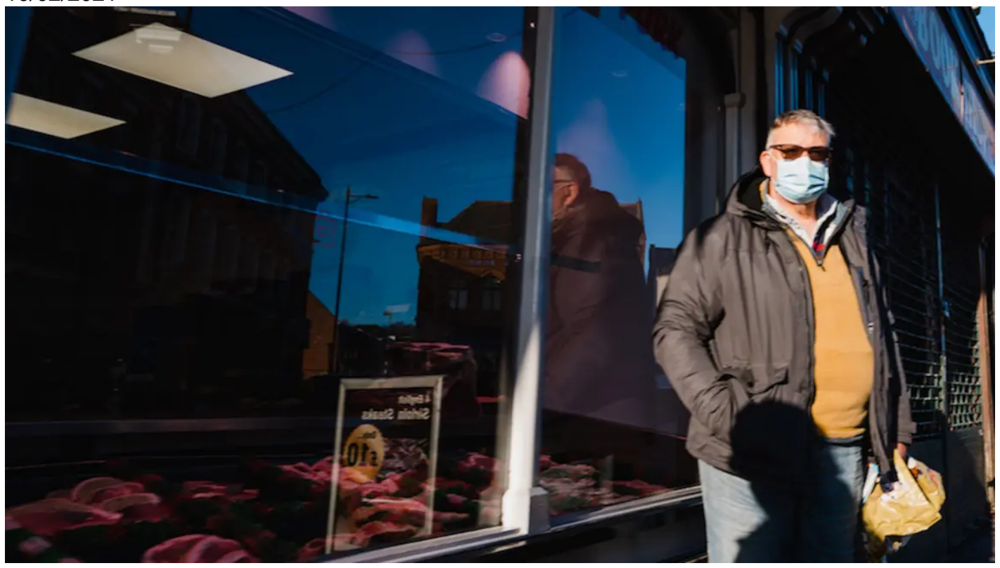
Wednesbury High Street Heritage Action Zone. Lee Allen High Street Heritage Action Zones cultural programme will enhance 68 English high streets through art, sound and film.

The £7.4m cultural programme, which launched today, is designed to secure lasting improvements to our historic high streets for the communities who use them. High streets from St Helen's to Stirchley and Wednesbury to Woolwich will benefit.