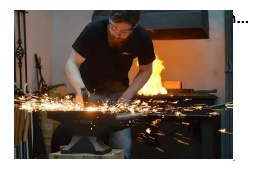
Full range of National Lottery funding resumes with refocused priorities for

Our <u>National Lottery Grants for Heritage</u>, which reopened for applications at all levels on Monday, is prioritising heritage projects that support local economies, places and communities throughout 2021-22.