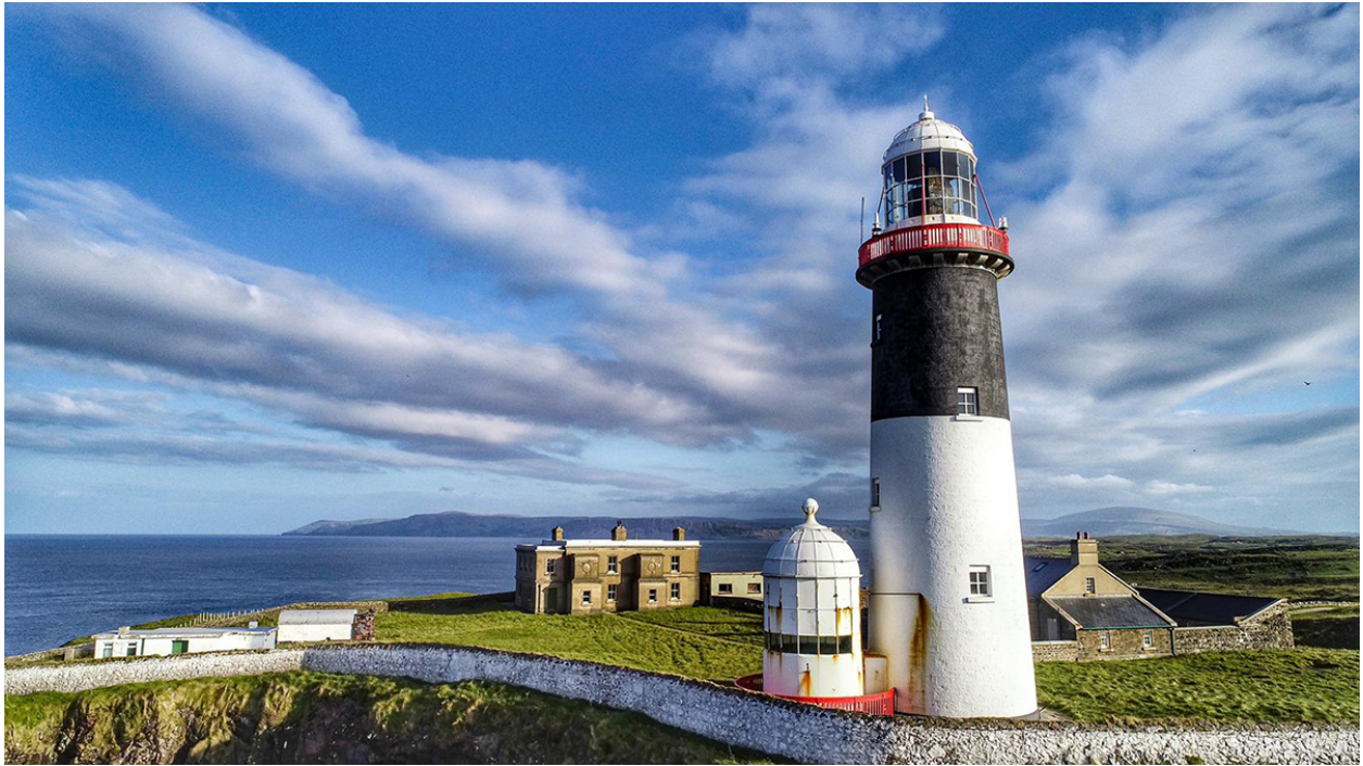
East Lighthouse, Rathlin Island.