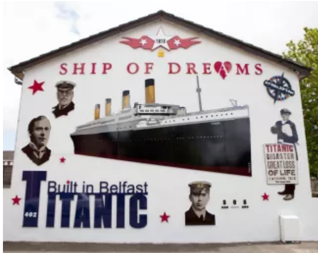
Newtownards Road Heritage Trail

The local community will be able to come together to get involved in craft-making and gardening, alongside learning about the quarry's heritage.