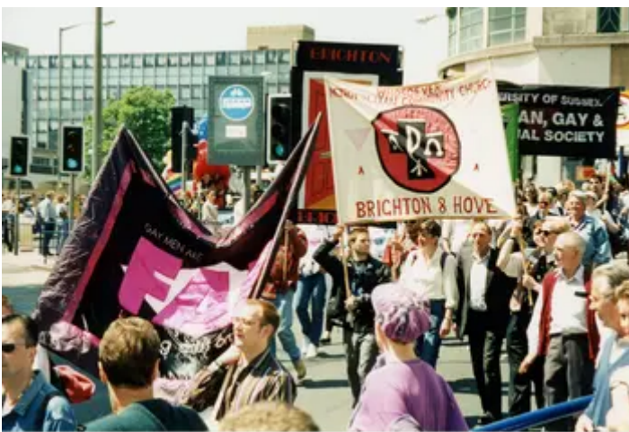
Brighton Pride, 1995.

Find out how the Museum of Oxford is currently undergoing a £3.2million museum redevelopment with the help of a £1.63m National Lottery Heritage Fund grant.