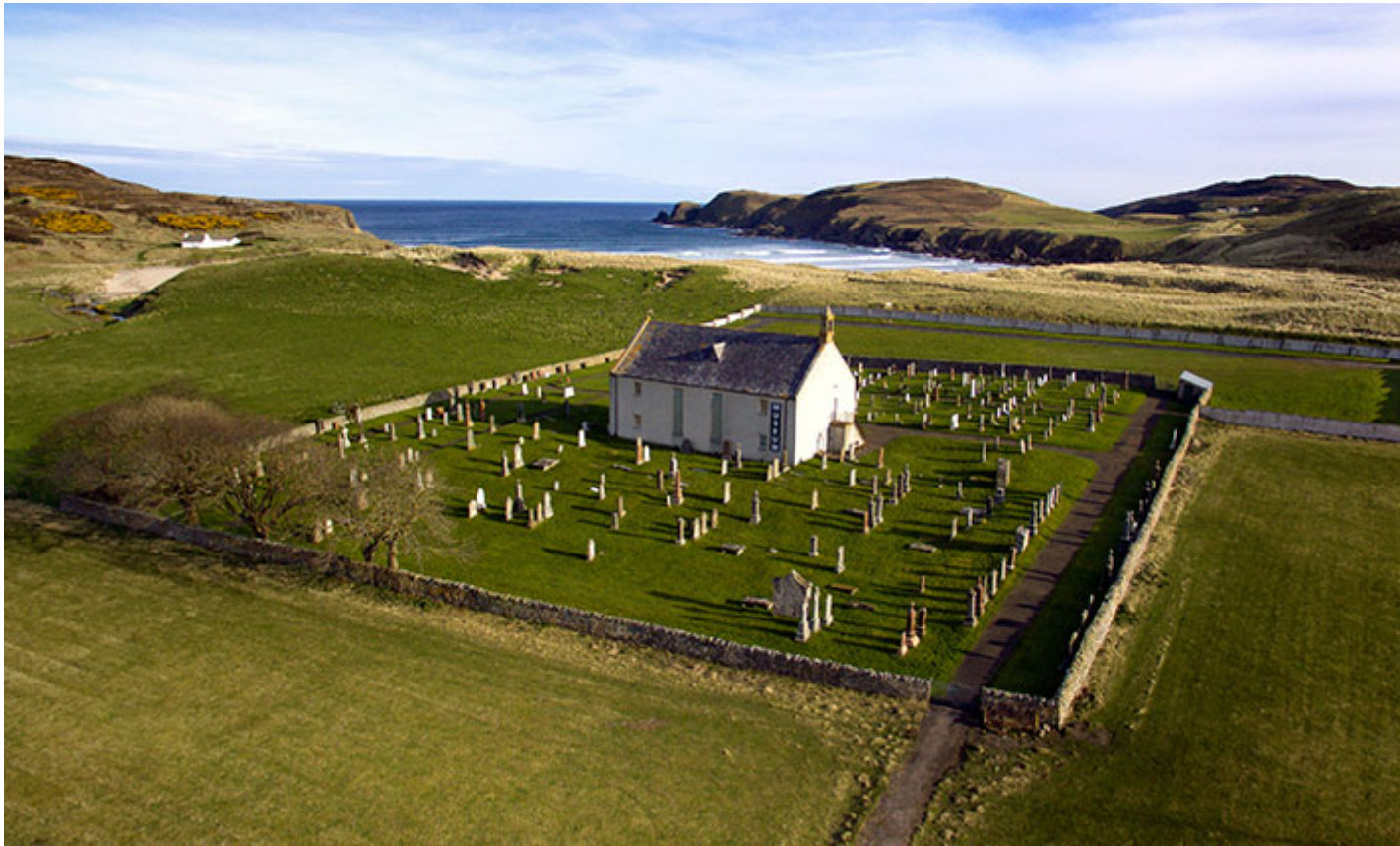
Strathnaver Museum and grounds

Strathnaver Museum, which tells the story of the Highland Clearances and the history of the Clan Mackay, has received a grant of £650,000 to further develop its museum - a former 1750s church.