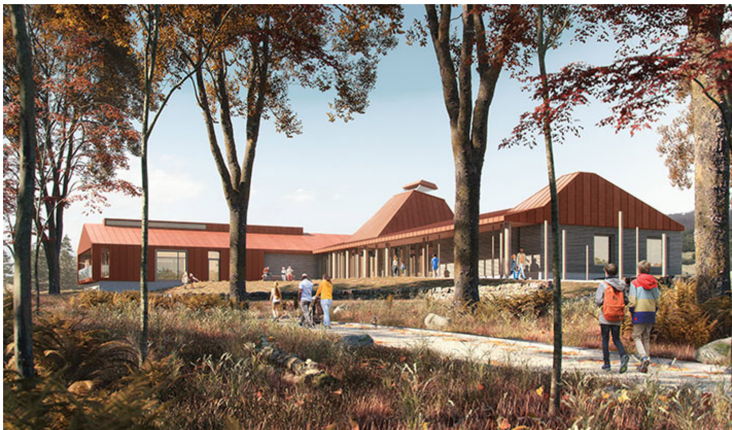
Visualisation of Dundreggan Rewilding Centre.

Dundreggan, a 10,000-acre estate in Glenmoriston near Loch Ness, has received a National Lottery Heritage Fund grant of £702,300 for Trees for Life to establish the world’s first rewilding centre.