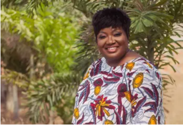
ent projects in Wales