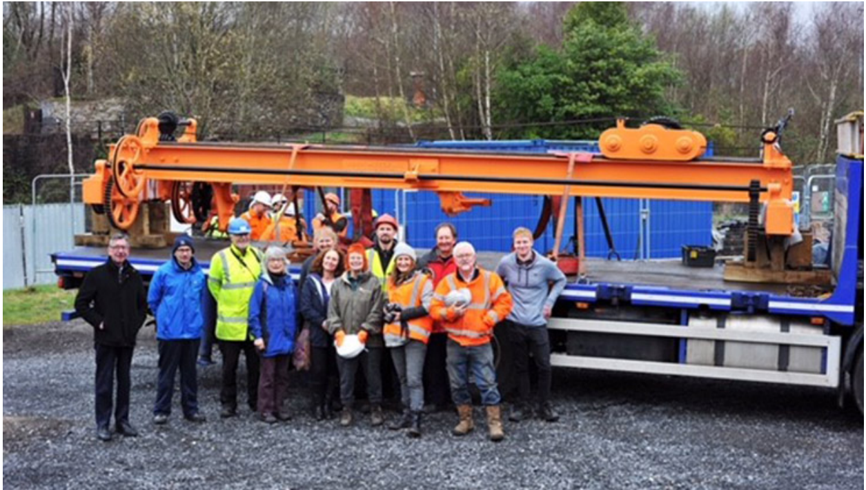
Hafod Morfa Copperworks.

In Cardiff, Watch Africa Cymru is receiving £9,600 for a project that will see young people exploring the history of Llanrumney and its connection with the famous pirate Captain Henry Morgan.