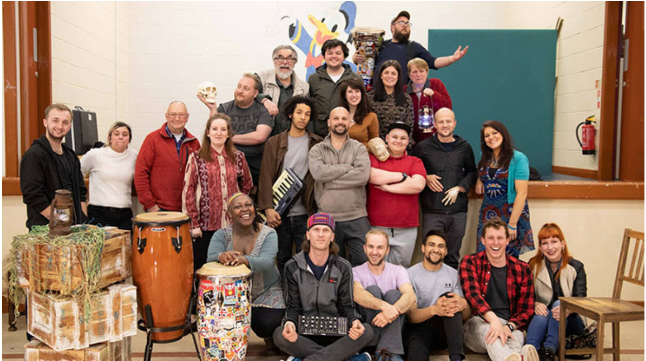
Tin Shed Theatre Company.