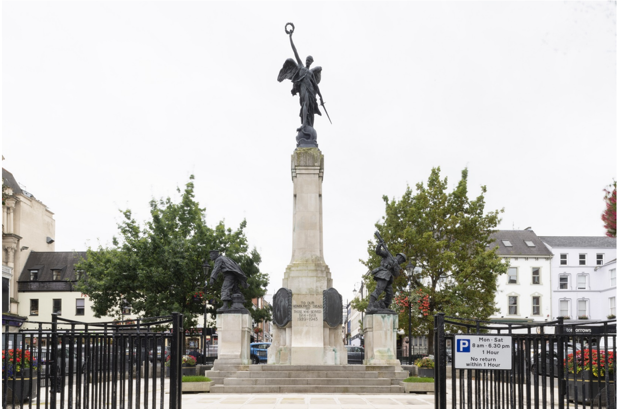
Diamond War Memorial, Derry/Londonderry

We want to support a diverse range of organisations, including for example, charities, local authorities, educational organisations, community groups and faith-based organisations.