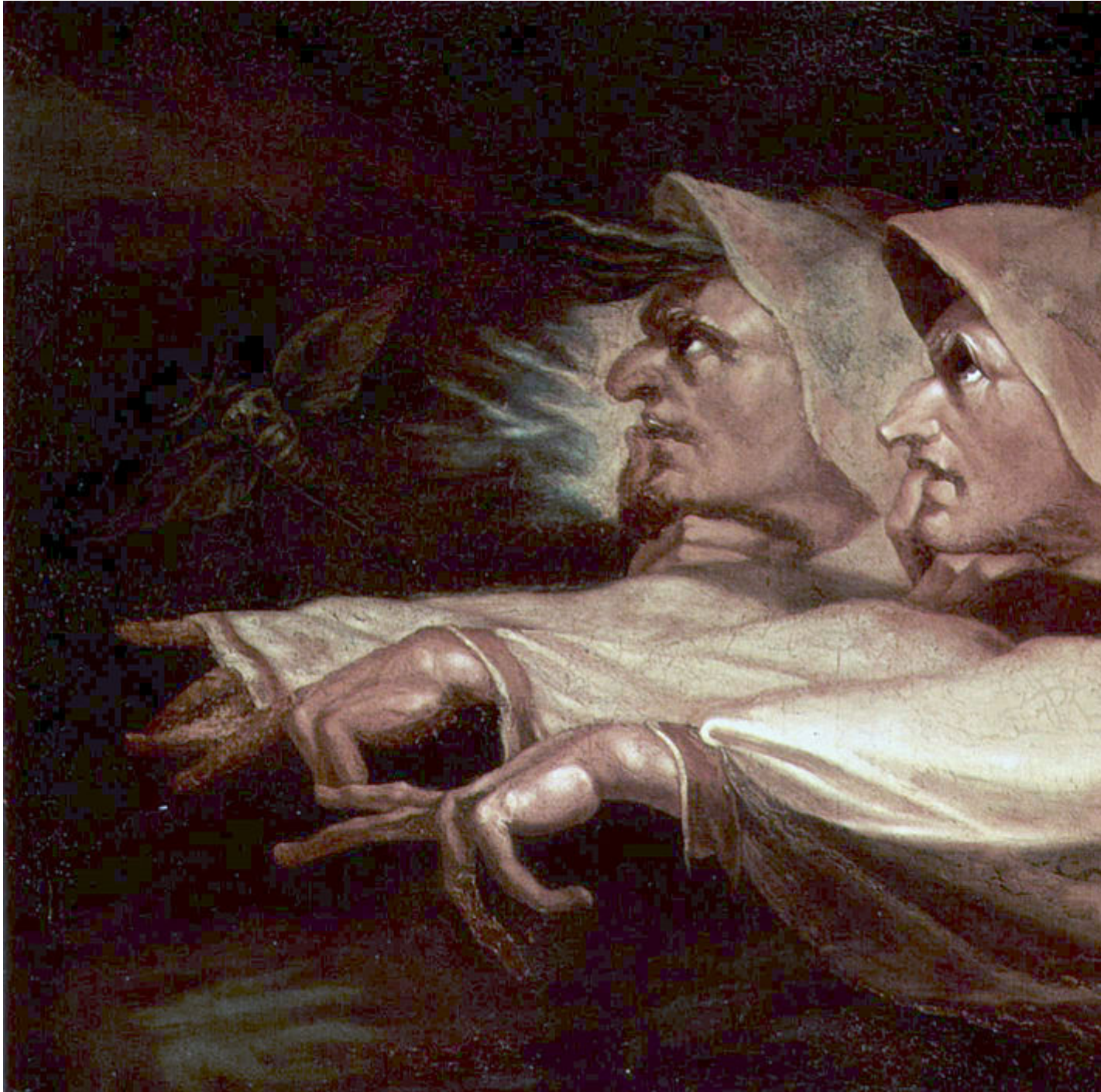
1783 Henry Fuseli artwork showing Macbeth's Three Witches.

She shares her experience of seeing a project brought to life through the innovative use of Open Data.