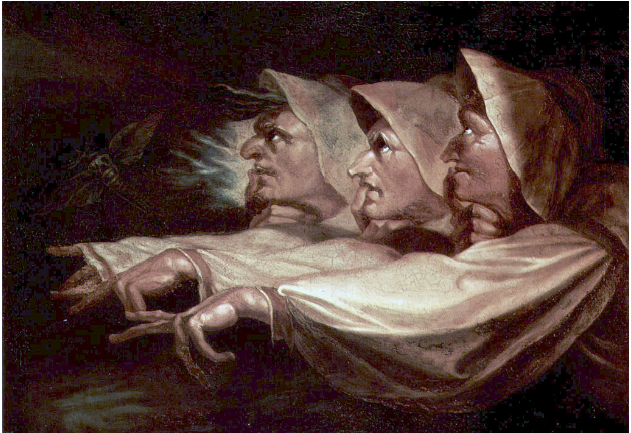
1783 Henry Fuseli artwork showing Macbeth's Three Witches.