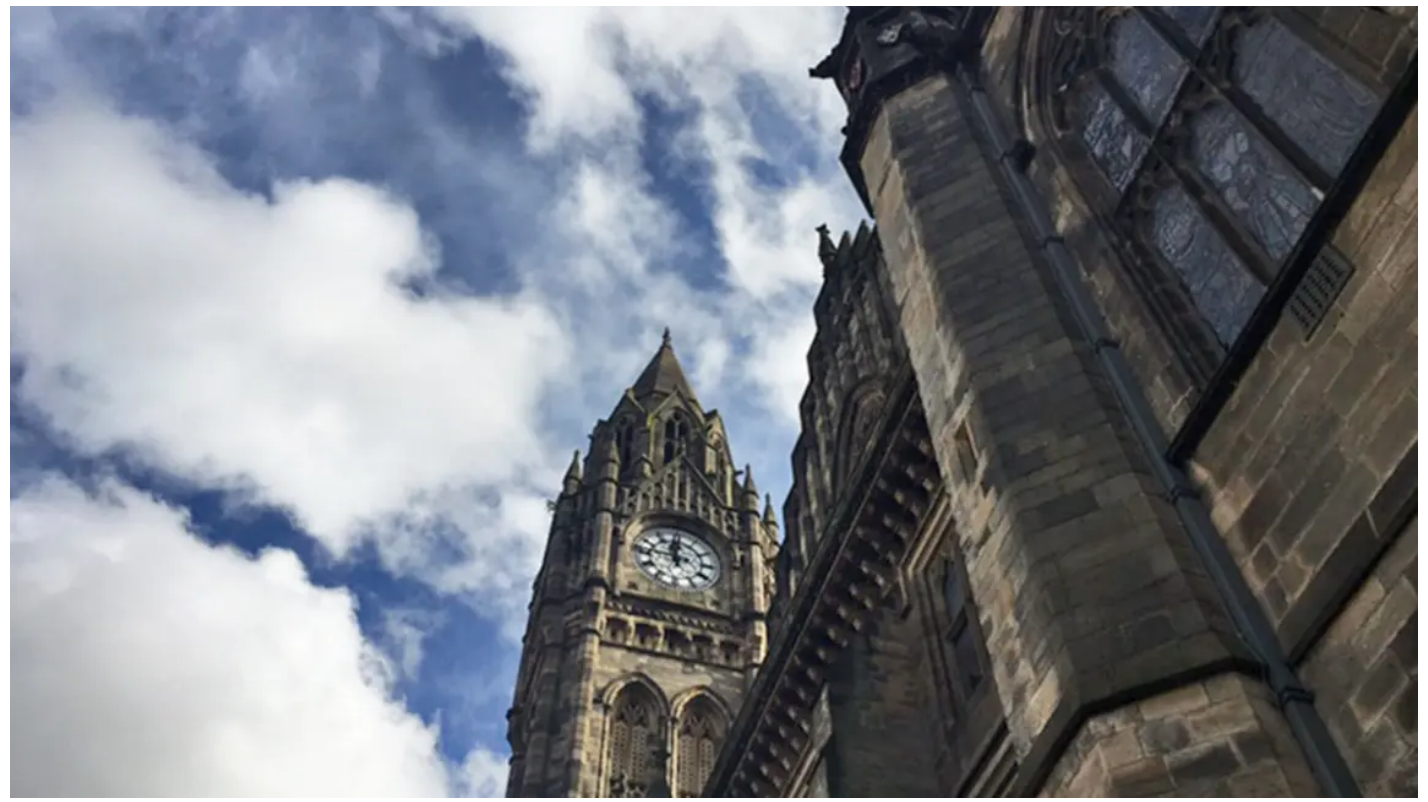
The wonderful Rochdale Town Hall has been given the green light for a much-anticipated revamp, thanks to £8.3million of National Lottery funding.

In the heart of Rochdale, the Grade I listed town hall, is one of the most historically significant buildings found in the UK. It is home to many remarkable historic features that have been described by Historic England as being rivalled in importance only by those within the Palace of Westminster.