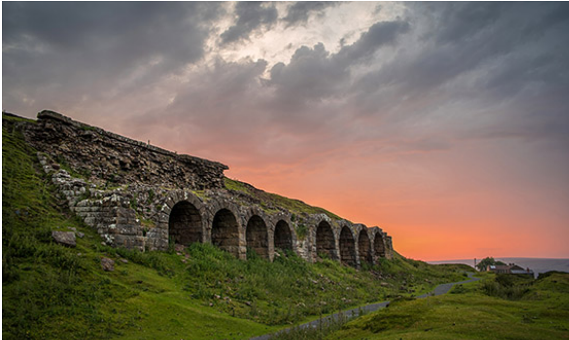
Rosedale Bank Top, North Yorkshire.

As well as improving the condition of iconic industrial features from the ironstone industry, the Land of Iron Landscape Partnership ensured that the historic monuments were recorded and conserved and that stories from this significant part of England's heritage were told.