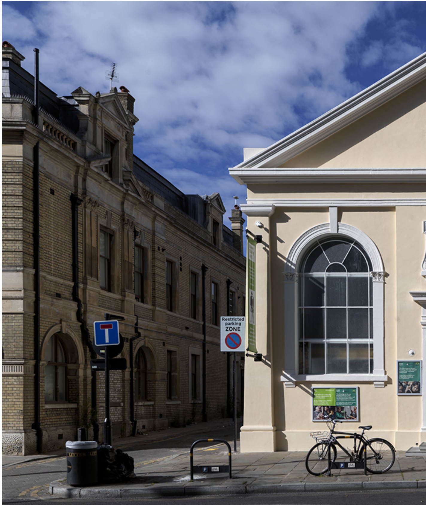
Newington Green Meeting House, Hackney.