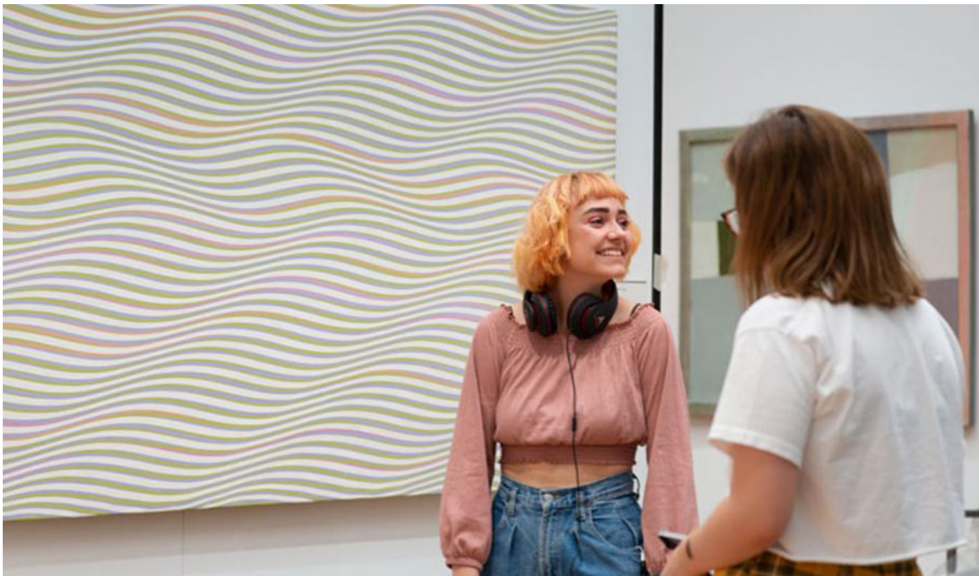
Visitors at Aberdeen Art Gallery