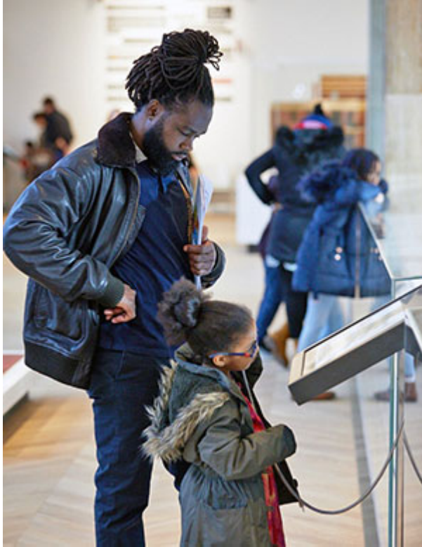
Visitors at the Science Museum

Gairloch Heritage Museum's converted former Cold War bunker opened in 2019 thanks to a £725,600 National Lottery grant. Now a first-rate visitor attraction and heritage hub, the investment secured the long-term future of the Scottish museum's collections and transformed the cultural activities it offers.