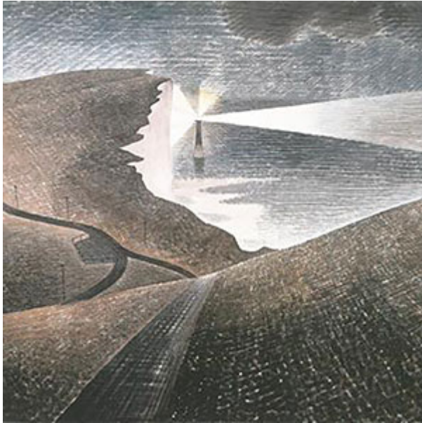
Beachy Head by Eric Ravilious, displayed at Towner Eastbourne