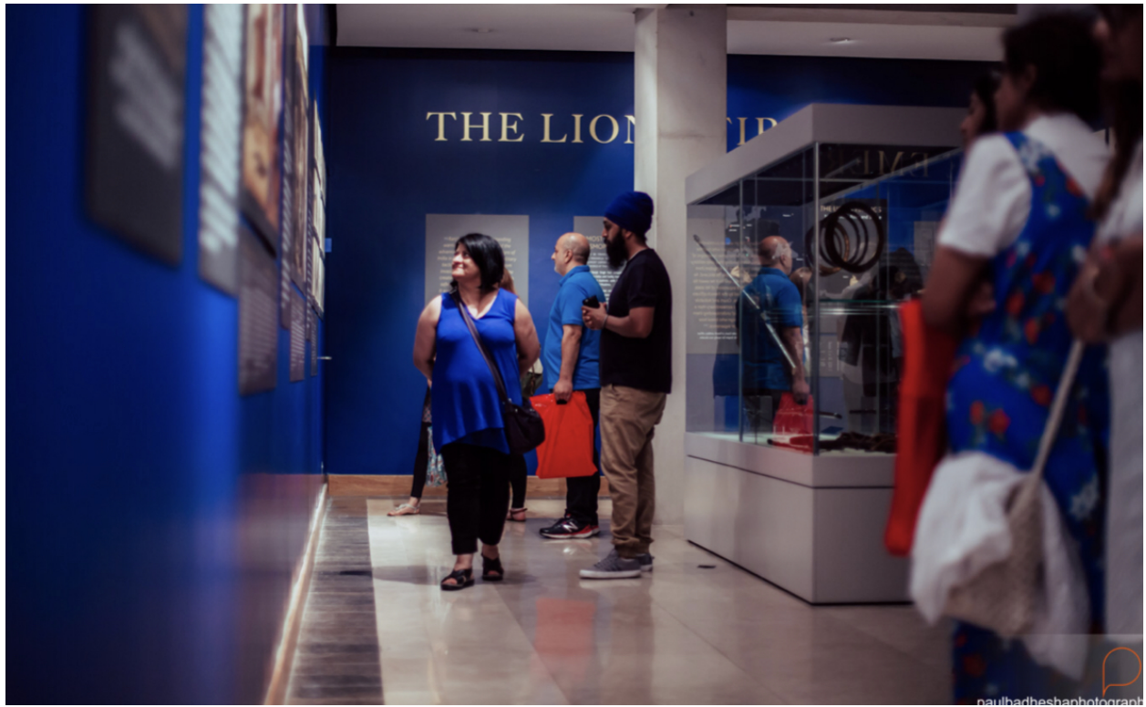
A pre-lockdown exhibition visit

Using a National Lottery grant from our Heritage Emergency Fund, UKPHA was quick to adapt.