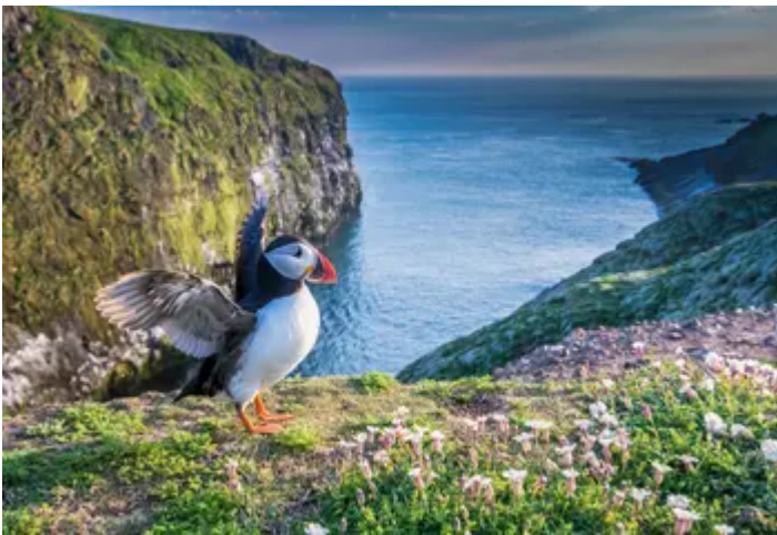
anks to emergency funding