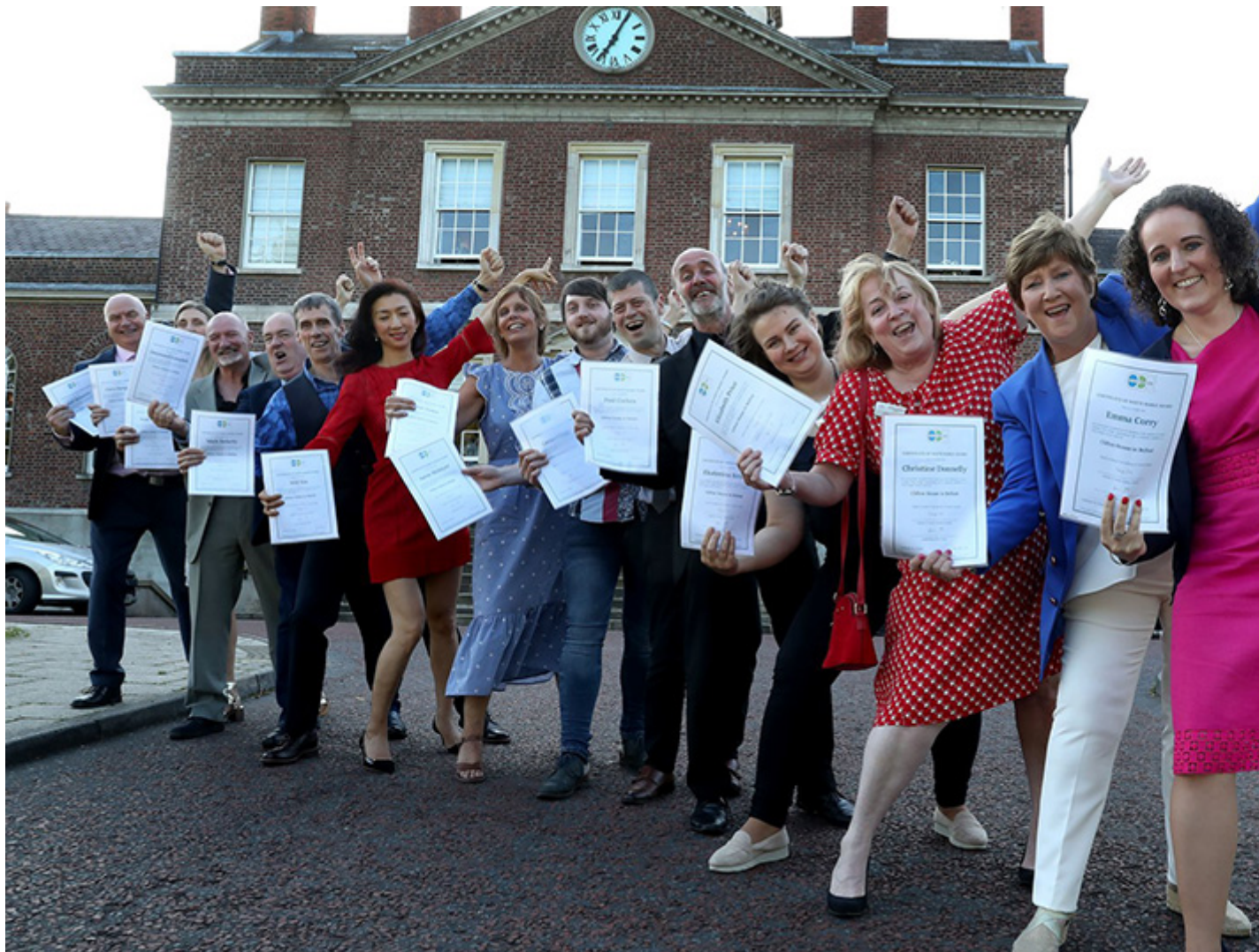
Clifton House's White Badge volunteer guides

Clifton Hall’s first virtual session attracted 75 people. Subsequent sessions have seen an increase in public engagement of over 200% on this time last year.