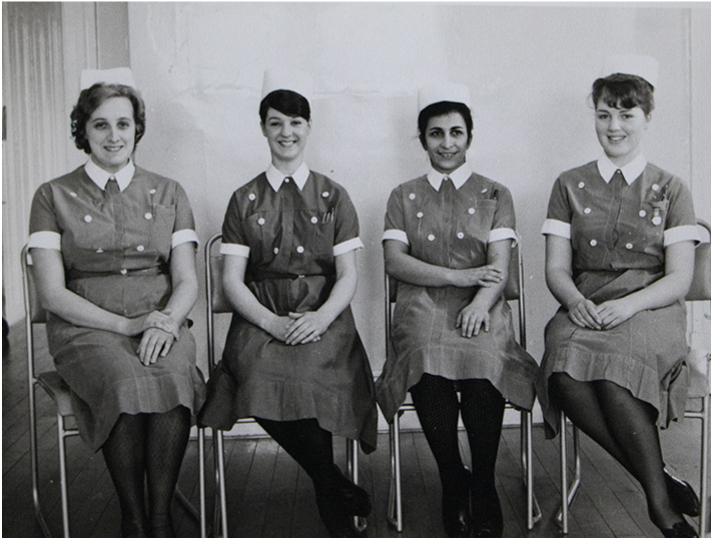
A photograph from the archives.

This is very easy to do on a mobile phone that will have a recording function on it. Start by making a list of topics that you'd like to cover. For example: