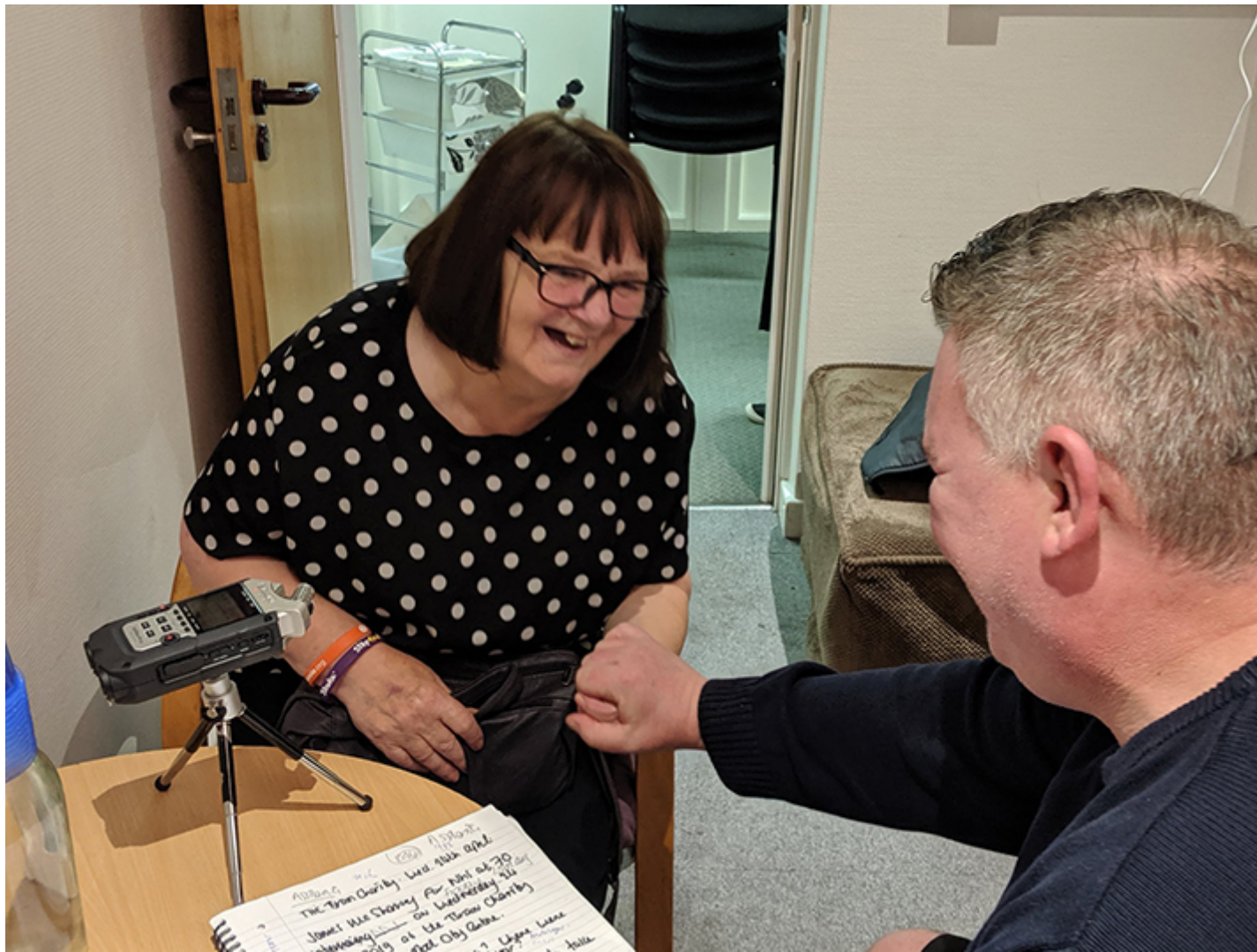
A volunteer interviewing at The Brain Charity.

Listening to people share their unique and personal details helps us to connect emotionally to the past. Through their stories we can begin to compare and contrast their lives and ours.