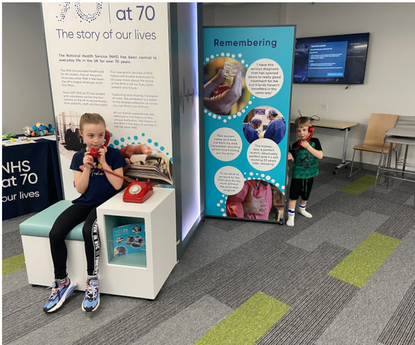
Children at the Moments of Care touring exhibition earlier in 2020.

We have around 60 volunteers spread across the UK and we know that they are valuing the opportunity to be involved and remain socially connected.