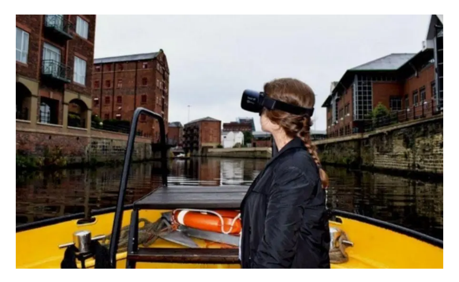
Cultures and memories