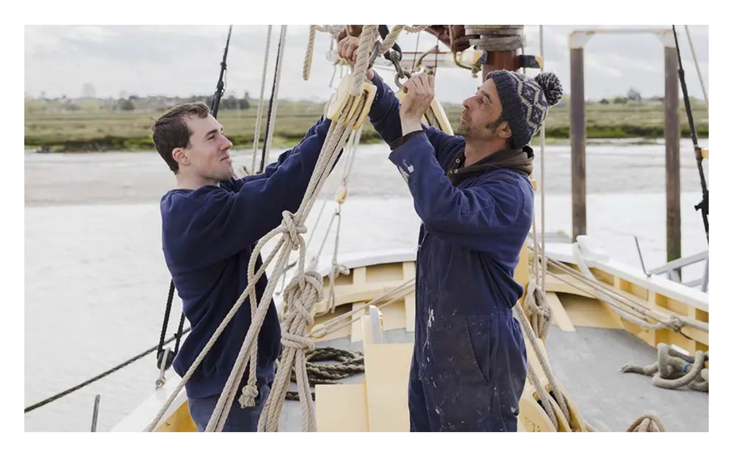
Industrial, maritime and transport