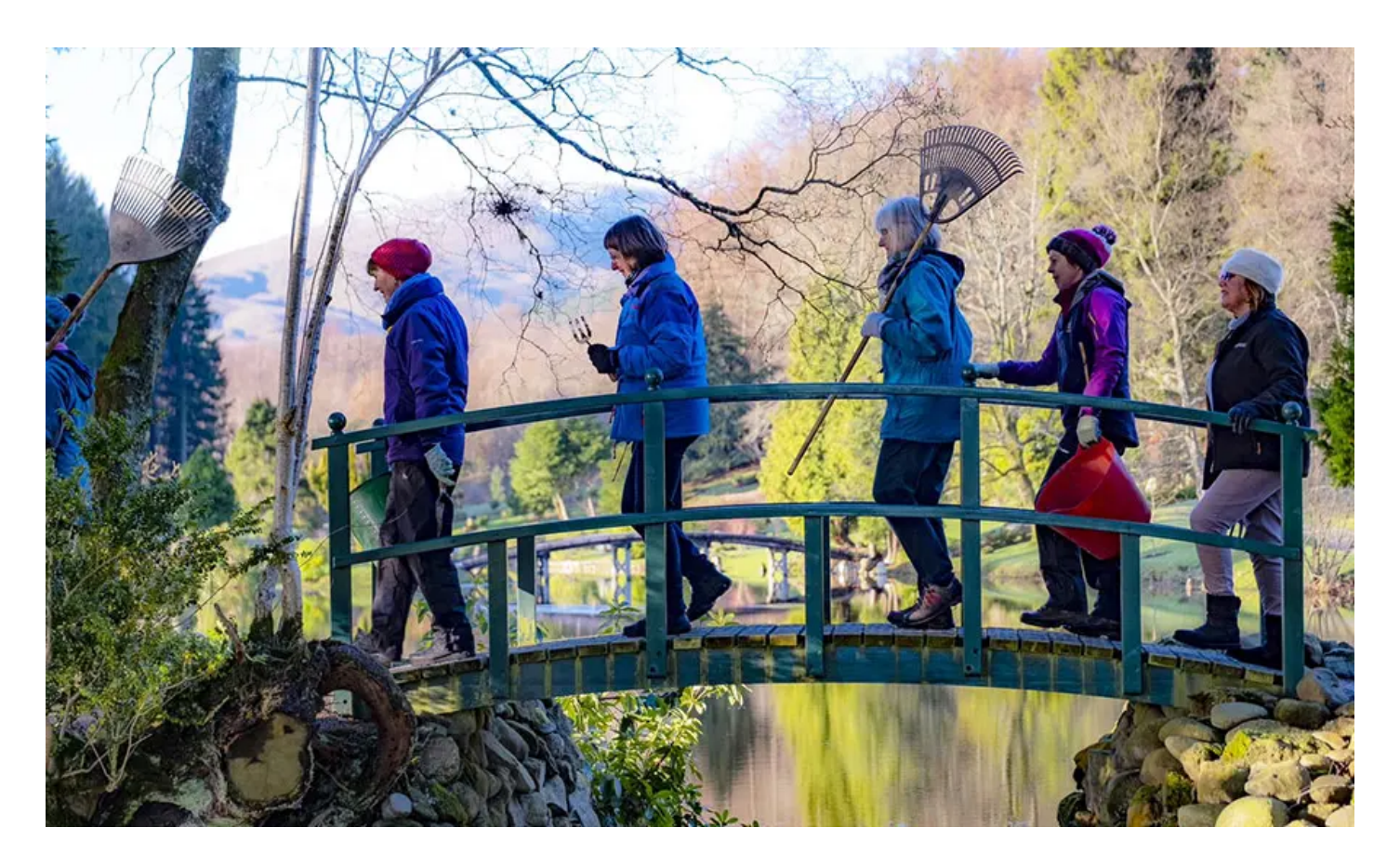
Landscapes, parks and nature