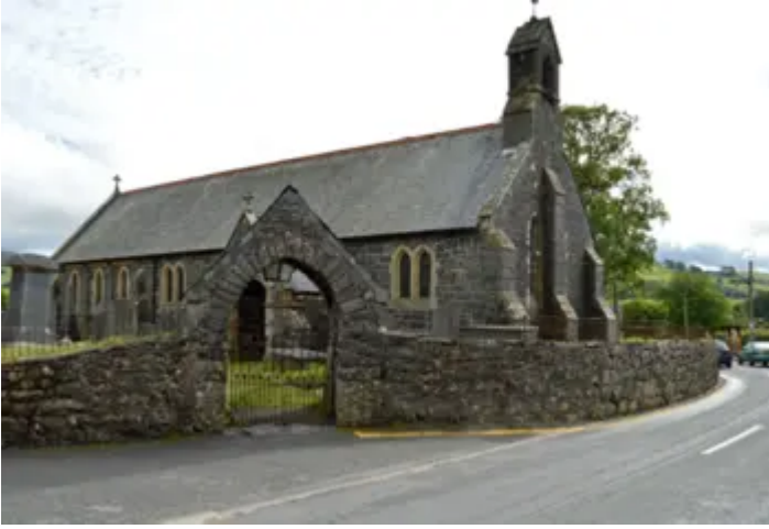
Eglwys Deiniol Sant, Llanuwchllyn