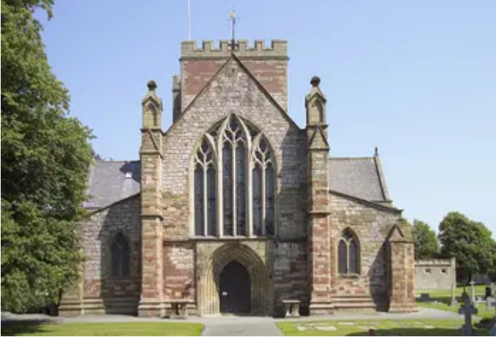
Eglwys Gadeiriol Llanelwy