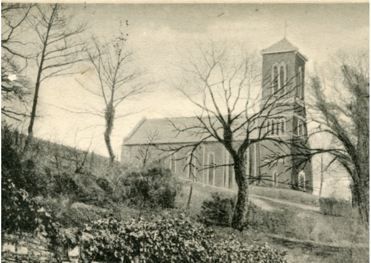
A vintage image of the church

Local historians and experts from Pontypridd Library, Pontypridd Museum and the Glamorgan Archives will also be involved in the project. They will help produce a bilingual exhibition and an illustrated booklet of the group's research.