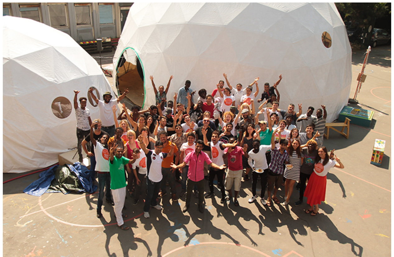
Good Chance Theatre, one of the 31 charities, who use geodesic dome theatres to work with refugees and local communities.