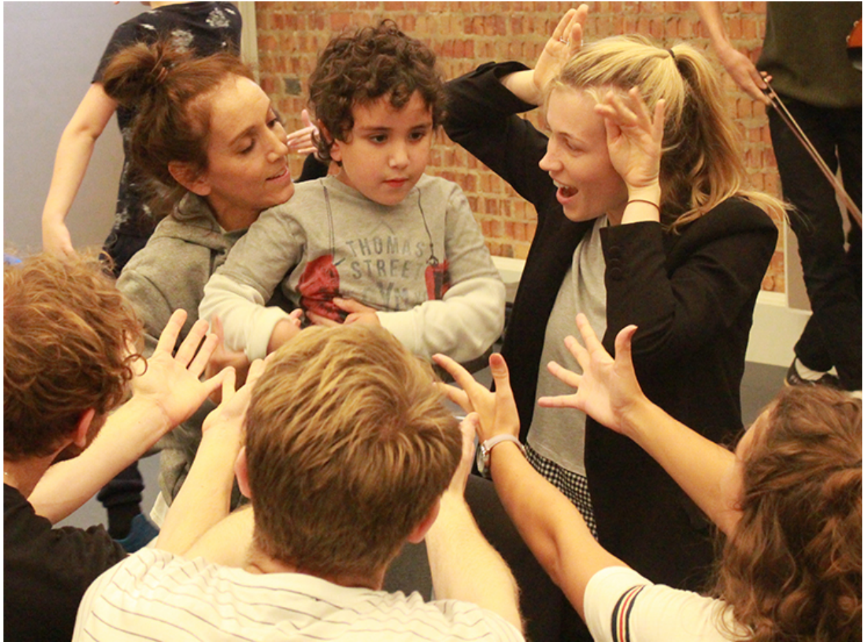
Flute Theatre helps people with autism