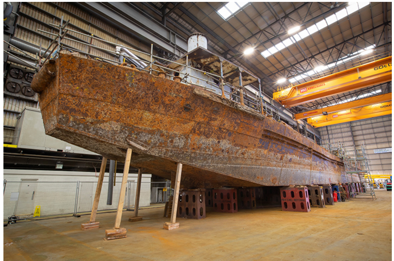
The National Museum of the Royal Navy is working to save the last surviving Second World War, D-Day Landing Craft Tank, LCT 7074

"There are not just financial benefits to (match funding), but also great opportunities for organisations to form valuable partnerships, gain new supporters and volunteers, and expand their audiences."