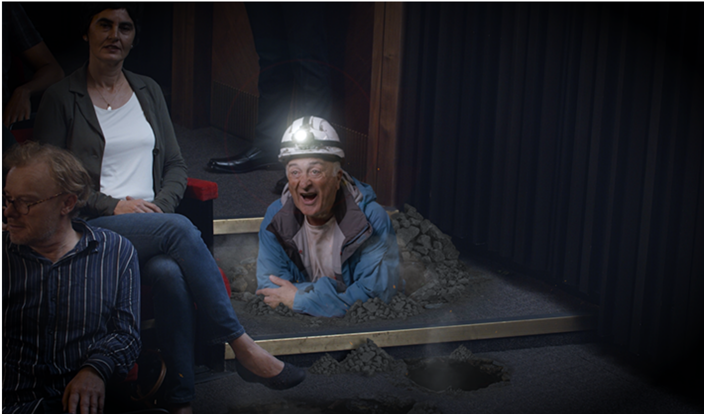
Tony Robinson emerges from the floor to celebrate funding for archaeology

Jimmy Carr concludes: “Right, but apart from charities, Wembley Stadium, community projects, medals, the Angel of the North, heritage sites, films, support for homeless people, green spaces, archaeology and wildlife – what’s The National Lottery ever done for us?”