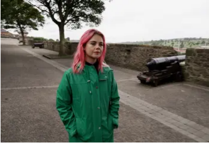
al Lottery players