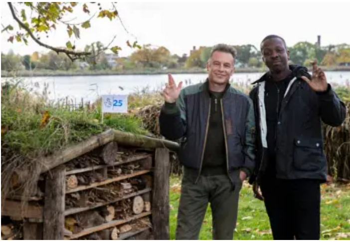
of her home city

Chris Packham and Jamal Edwards celebrate 25 years of funding for nature