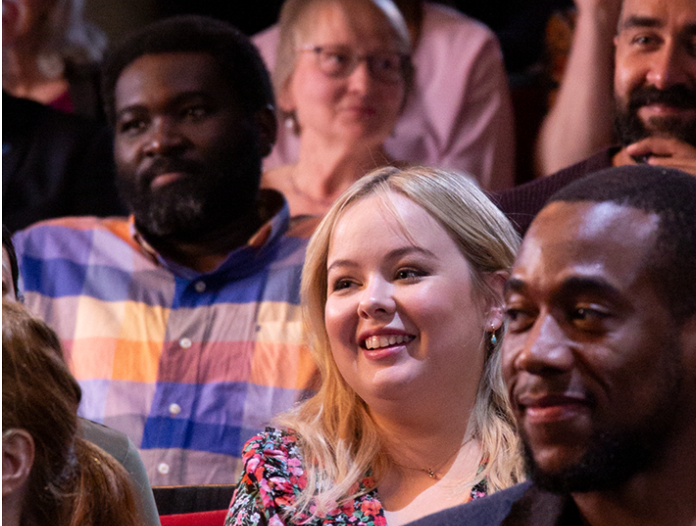
Derry Girls star Nicola Coughlan was in the crowd to celebrate National Lottery funding

Athletes, stars of the screen and other famous faces add their ideas to a fast-growing list of how £40billion of National Lottery funding has changed people's lives in the areas of sport, arts, community and heritage.