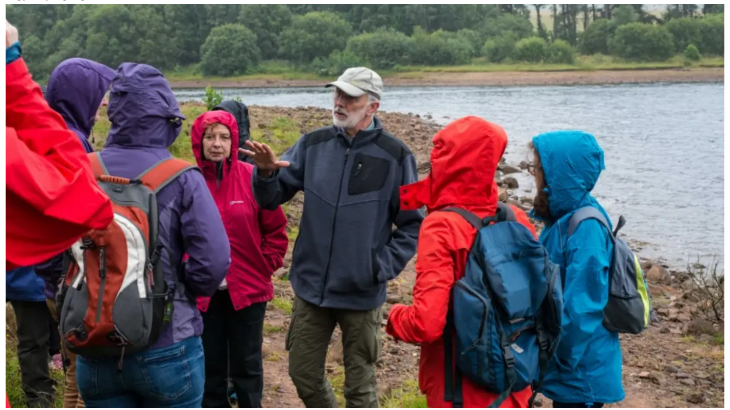
It's 25 years since The National Lottery began. In celebration, staff from The National Lottery Heritage Fund take a look back at some of our favourite memories.