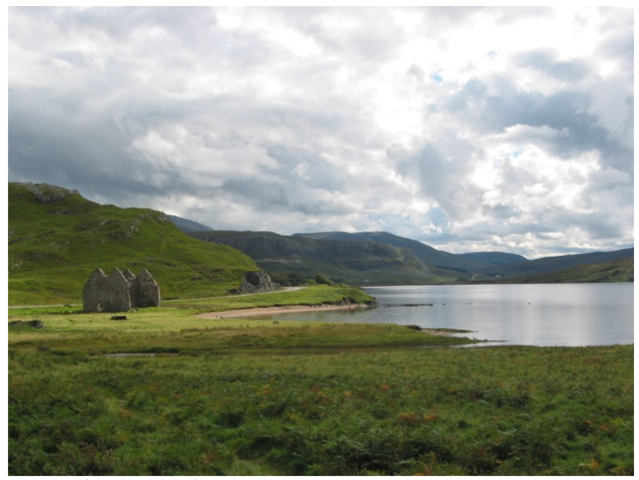
The beautiful landscape of Inchnadamph

In 2008 I went on my first site visit to Inchnadamph in the North West Highlands. It was the furthest north I had ever been on mainland Scotland, and I was blown away by the incredible landscape and fascinating history of the area – the projects I have the privilege to work on often have this effect even after 11 years.