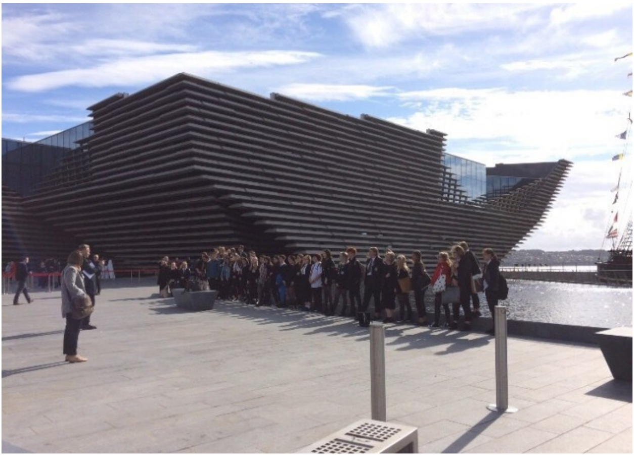
The opening of V&A Dundee

Now I love that my job is sharing heritage stories, and some of my favourite memories of working at The National Lottery Heritage Fund have been made while visiting fabulous projects to create films. Like having a <u>ride on a fire truck in Rochdale</u>, discovering inspiring stories at the <u>International Bomber Command Centre in Lincolnshire</u>, visiting Dundee for the first time for the opening of the <u>V&A Dundee</u>, and learning about the skill of gardening when interviewing a trainee at the opening of the <u>Temperate House</u>, Kew.