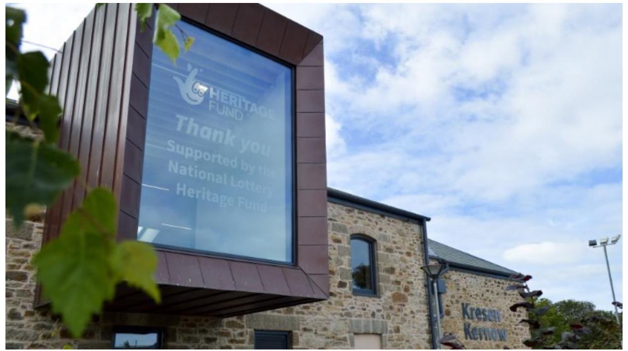
A big thank you from Kresen Kernow in Cornwall