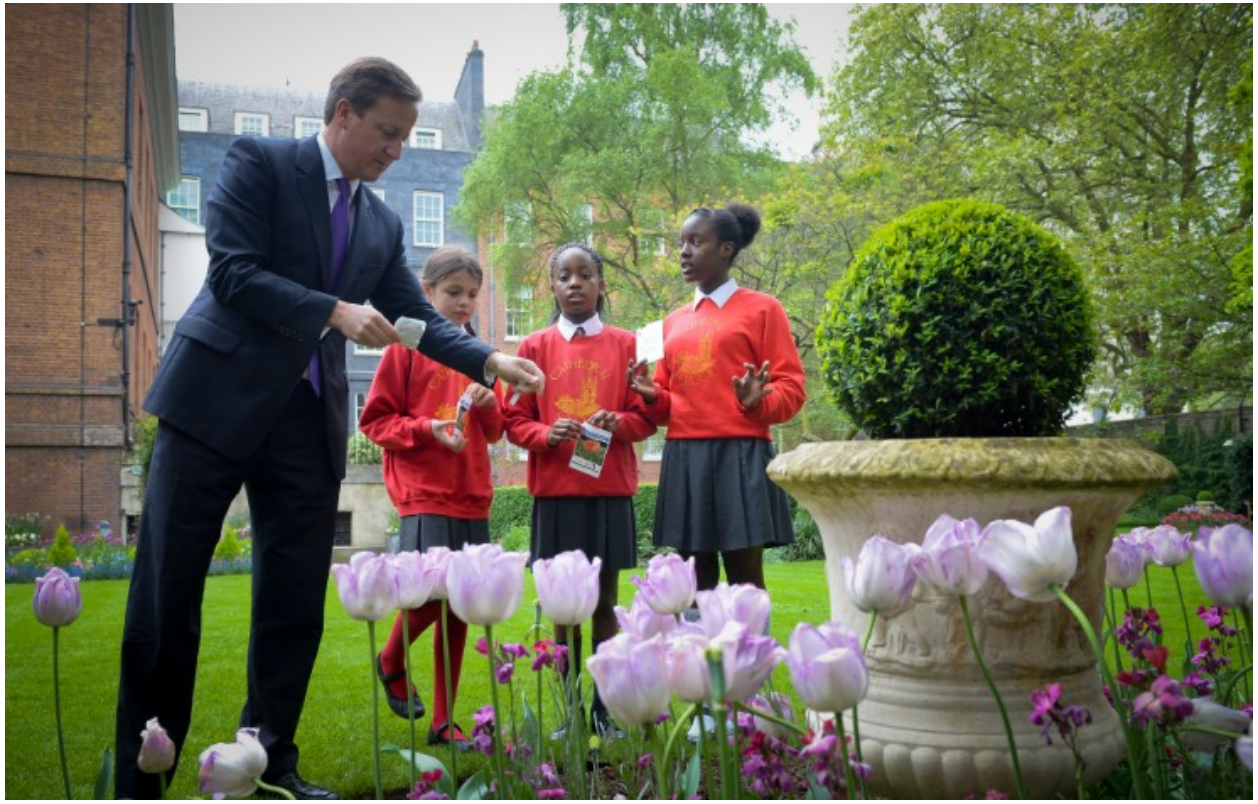
Former prime minister David Cameron helping children sow poppy seeds