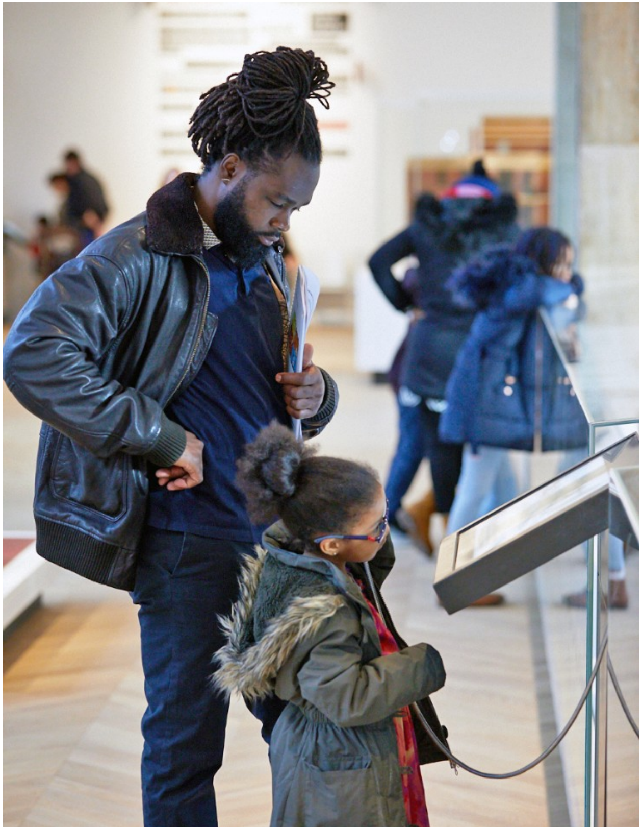
Visitors enjoying the new exhibits in Medicine: The Wellcome Galleries.

Here are some of the things you can do at the new galleries: