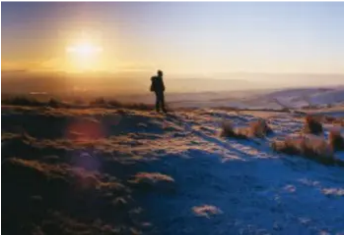
Pendle Hill at sunset

Find out more about the 25th Birthday celebrations .