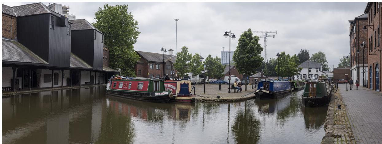
Coventry canal.

The National Lottery Heritage Fund CEO Ros Kerslake said: “City of Culture status presents Coventry with an incredible opportunity to drive economic and social prosperity by putting heritage and culture at the centre of its place strategy.