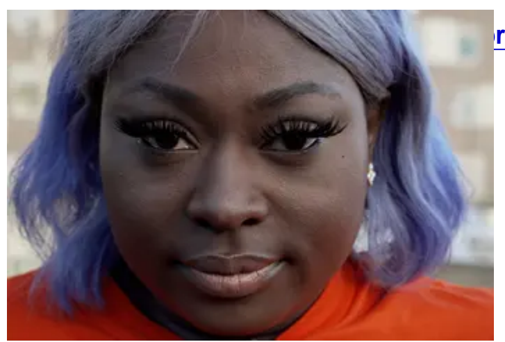
ride of Blaenavon

25 years: from church to grime, Waltham Forest celebrates its heritage