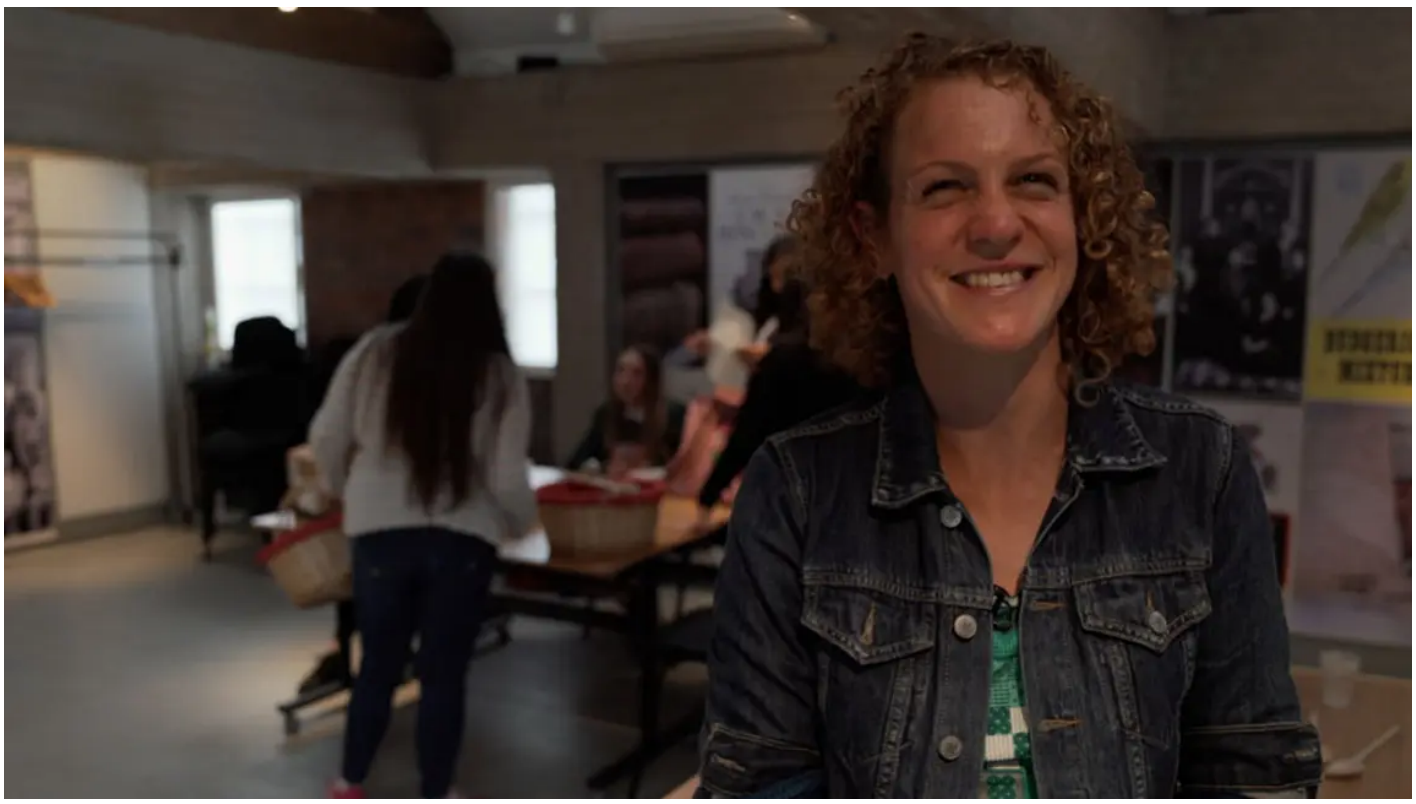
Once a bustling hub of the Industrial Revolution, after years of decline Rochdale is facing a brighter future thanks in part to 25 years of National Lottery investment.

"The River Roch ran beneath our feet encased in slabs of grey concrete but now it runs again so free as once it was and so should be..."*