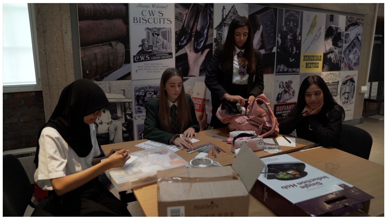
Young people involved with the Pioneers Museum's Exploring Pioneer Places project

It is a town of radical community. Rochdale is where the modern co-operative movement began 175 years ago this December. On 21 December 1844, the Rochdale Society of Equitable Pioneers opened their Toad Lane shop. Set up to sell food at affordable prices during a time of hardship, it sparked a global movement.