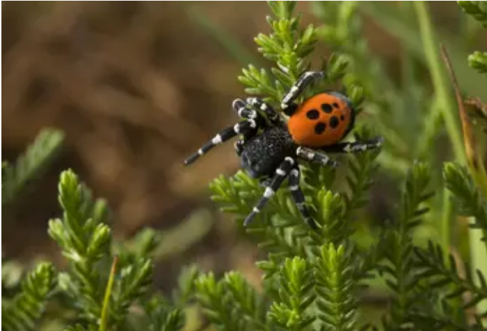
The endangered Ladybird spider

Over the past 25 years , The National Lottery Heritage Fund has been the largest dedicated grant funder of the UK's heritage. We've awarded £8bn to more than 44,000 projects across the UK.