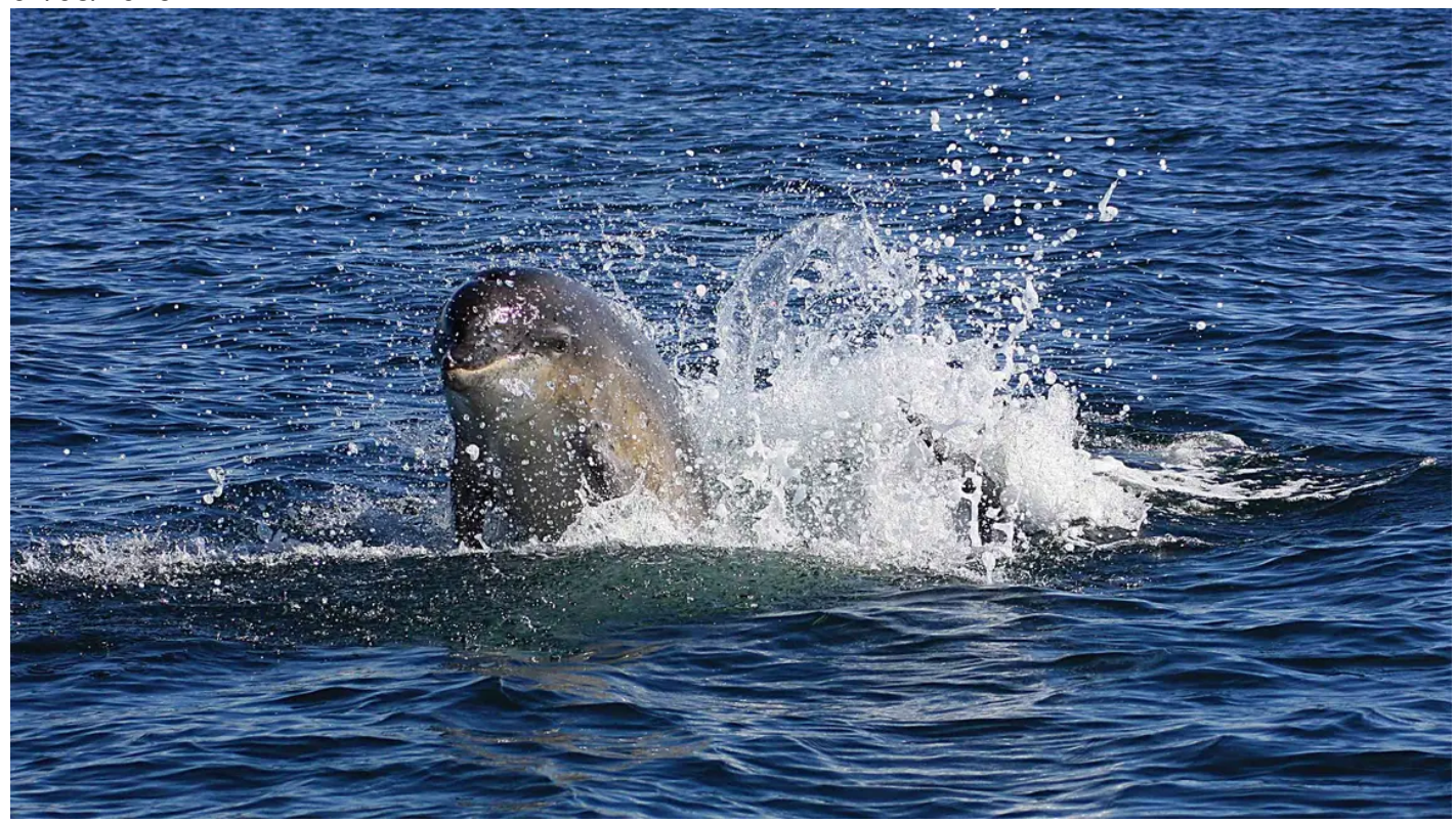
The summer holidays are perfect for spending quality time outside with your loved ones. Need inspiration for what to do? These nine National Lottery funded ideas are a breath of fresh air.