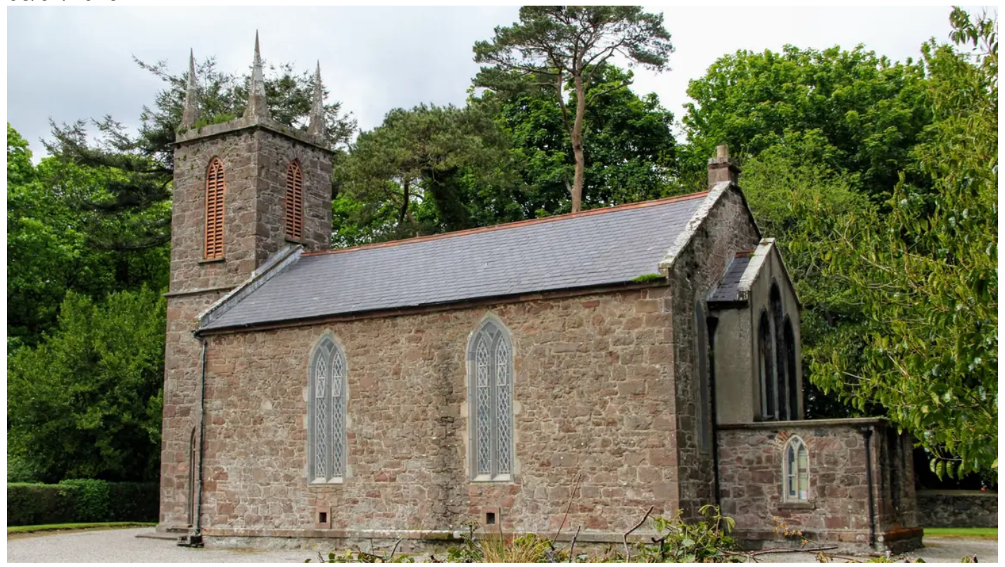
After 13 years of campaigning and fundraising by local people, The Old Church Centre has opened in Cushendun, County Antrim.

The old church building was runner-up in the BBC Restoration series in 2006.