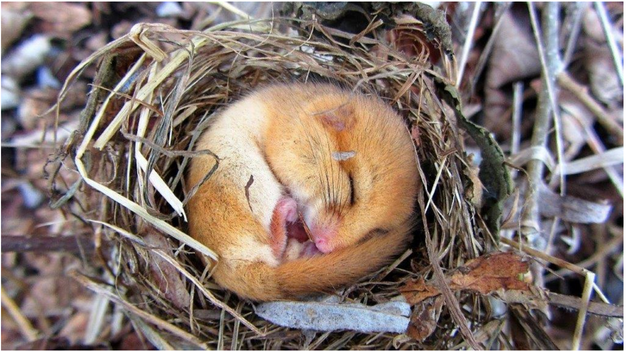
Hazel dormouse.

Back on Our Map (BOOM) is a four-year, University of Cumbria-led project fighting to save the future for the hazel dormouse, Duke of Burgundy butterfly and small blue butterfly in South Cumbria.