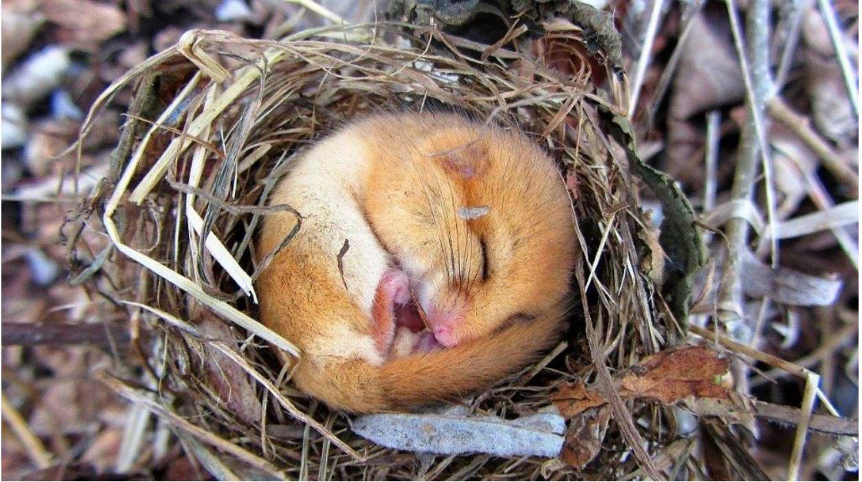
Hazel dormouse.

Back on Our Map (BOOM) is a four-year, University of Cumbria-led project fighting to save the future for the hazel dormouse, Duke of Burgundy butterfly and small blue butterfly in South Cumbria.