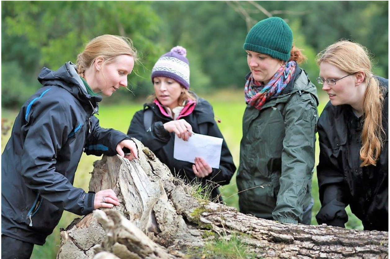
Student conservation volunteers - University of Cumbria

BOOM will be delivered in partnership with Morecambe Bay Partnership, Cumbria Wildlife Trust, Natural England and The Forestry Commission.