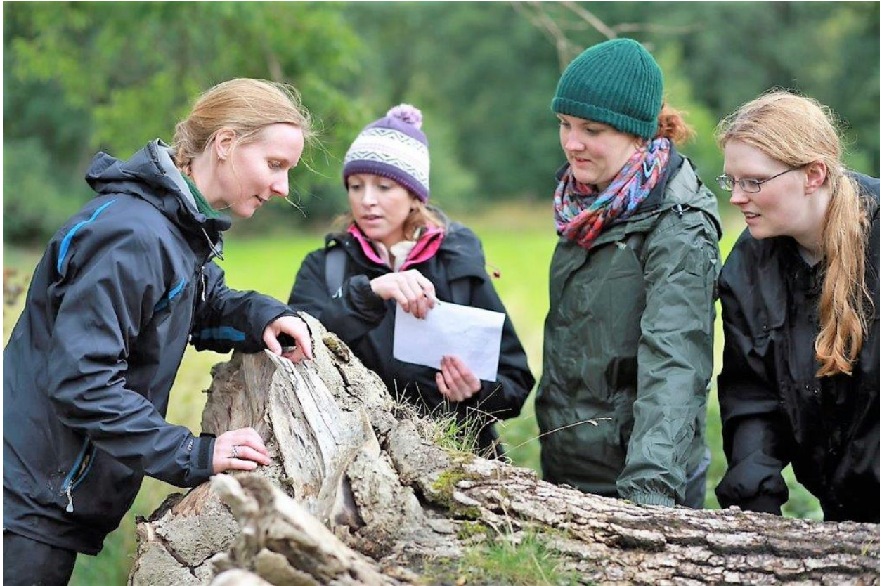
Student conservation volunteers - University of Cumbria

BOOM will be delivered in partnership with Morecambe Bay Partnership, Cumbria Wildlife Trust, Natural England and The Forestry Commission.